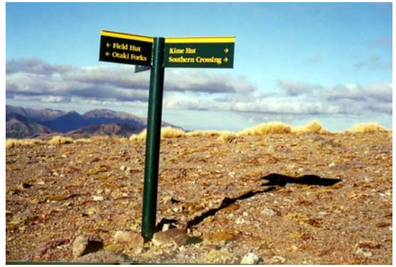
Show me the wav...

Thus it was that we made steady progress under the hot sun of the first of a series of brilliant days, up to the little seat cut from a fallen tree short of Field hut where we broke for lunch. We had been passed by a steady stream of people apparently all heading for Kime and a report from someone coming down had us thinking of a night in a packed hut or even in the flysheet somewhere outside. Perhaps that was the explanation or is it the curse of Field hut? but as always seems to happen when we arrived there we were hot tired and an emergency brew up was called for. Ah tea. What more need I say? After Field, altitude was gained steadily, water was drunk in large amounts and the view steadily opened up. I'd wax lyrical about it if the view the next day hadn't been so outstanding. A surprising number of people were camping around about Kime but the hut was only half full which was a pleasant surprise. The campers had certainly chosen their day for it, beautiful weather, fairly still and a cracking sunset into the bargain. We settled into Kime hut and combined our resources to cook a massive meal topped off with a chocolate cream cake thing. We listened to Wellington beating Canterbury on a hunters light radio gadget and then passed a restful night (at least I did).