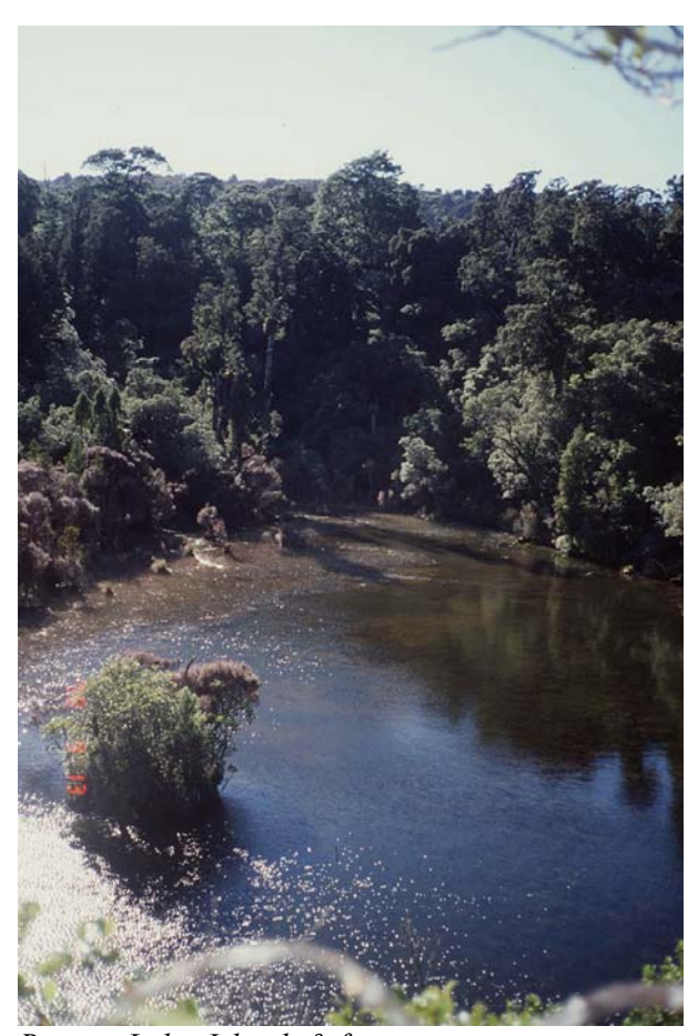
Ruapae Lake, Island, & forest.