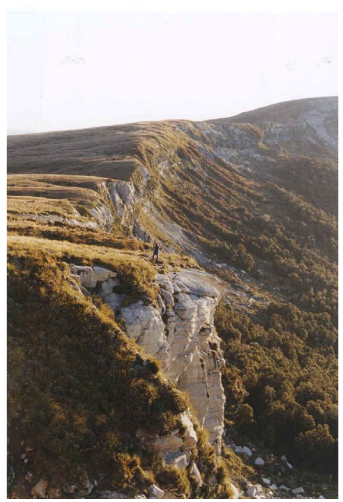
Limestone bluffs of "The Devils Dining Table", Mohikinui Catchment.

On day one. we sweated and cruised our way past Lake Matiri and Poor Petes Hut. Gorgeous country, views, and weather.