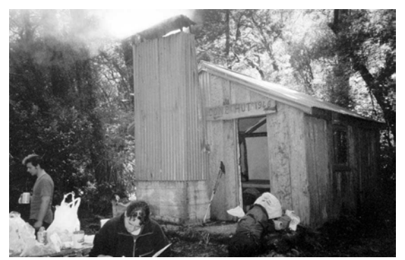
Cone Hut, Tauherinakau Valley built 1946, rennovated 1989

agreeing to lead the East-West trip at short notice and thus making the transport plans so easy.