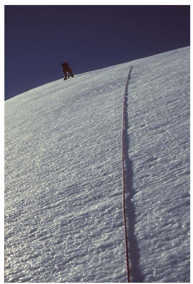
The final pitch to Madeline.