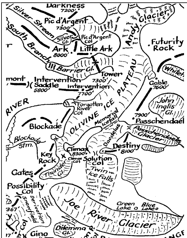
The Olivine Ice Plateau, from a map, by NZAC 1964. NB The plateau is about 1 km wide. Also note that all of these glaciers have shrunk considerably recently.

Last summer, a few club members, and friends, visited the alpine wilderness of the Olivine Range, in Mt Aspiring National Park, and did some good climbs. Here is their story.