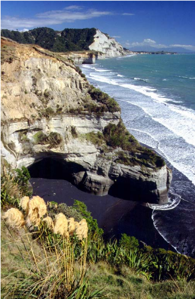
"Tongapurutu cliffs"