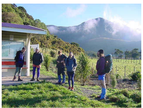
Waiting for the Train...

If you are going to try cross-country skiing, start with a small country.