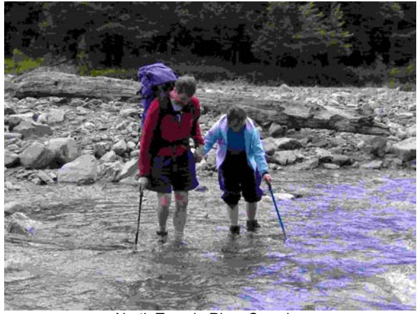
North Temple River Crossing

Middleton on the side of Lake Ohau which was remarkably warmer out of the wind.