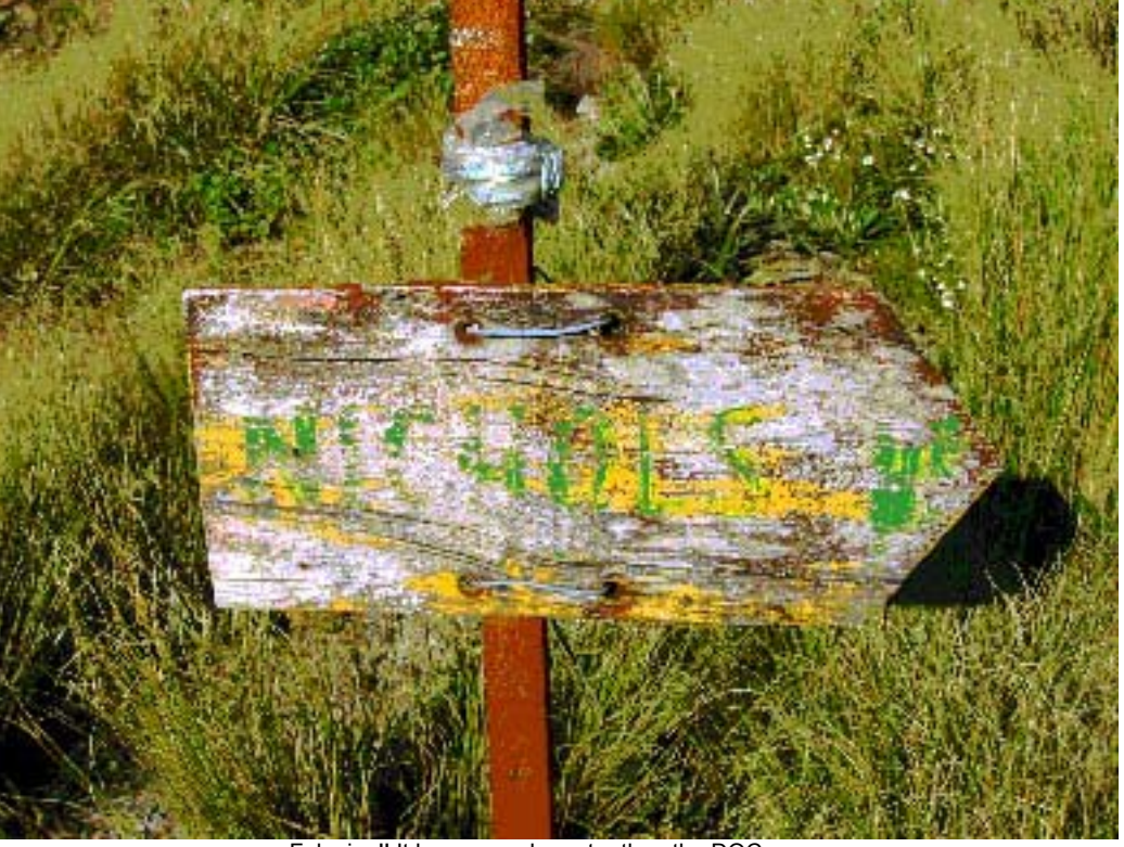
Fab sign!! It has more character than the DOC ones.

Junction Knob and they said the Gliders were below them!!