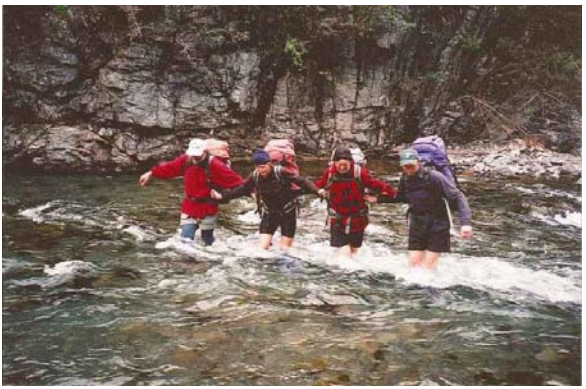
Makaroro River crossing

down to the waters edge, but still with nice gravel beds to walk along, keeping where possible to the sunny bits.