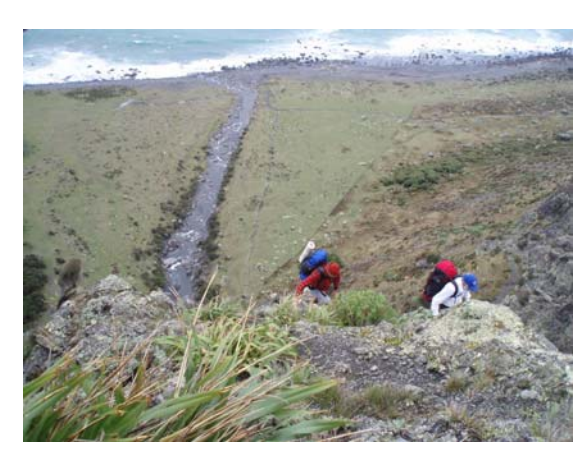
Terry and Murray on the first climb above the beach (the stone wall is the thin line on the right of the stream).

Further up the spur, a scrubby sidle brought us to a kanuka face allowing a steep descent (after lunch) into the stream. From here travel up the stream was easy until we reached a narrow gut that required a waist-deep wade. We carried on upstream until we reached the Stonewall Basin and found the base of the spur leading to Mt Raeotutemahuta (which was our intended route to the tops, and the tarn we were heading for). We set up our fly camp on the only flattish terrace above the river and had a leisurely dinner while adding extra layers of clothes against the growing cold. Some brief squally showers passed during the night then we were up at daylight, breakfasted and off up the stream to find a way on to our spur.