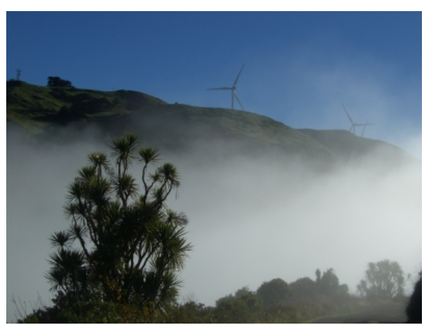
Emerging from the fog on North Range Road

South Range Road is now closed but it has not always been so. It is a pity as on a fine winter's day it affords some of the best vistas of Palmy and the central North Island laid out beyond.