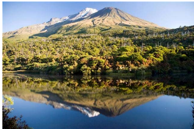
View from Lake Dive.

A bit of a descent to Lake Dive where we settled into the eponymous hut. A spacious hut which would cope well with school groups, and was more than adequate for our group of four. Cathy and I went for a swim in the Lake – it was very shallow with a muddy bottom, but it was pleasantly warm and refreshing. (Note to self: take togs if visiting Lake Dive again). The blokes were not into swimming but did some serious washing so we were all clean by tea time.