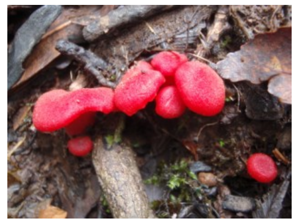
Hygrocybe rubrocarnosa, A bright red wax gill fungus.

Views were scarce to the east, with only the occasional peep out towards the Mangahao Dams, but never actually a view of them. There were three cut lookouts to the west, which showed us some of the plains and foothills, and gave us a good indication of progress. At Archey's Lookout (about half way), we paused for lunch and to chat to some locals. It was from there that the vehicle drivers returned north, allowing the remainder of us to continue south. We crossed several attractive headwater creeks of the Mangaore, then Makahika Streams, all set in more open and regenerating tawa forest. By then, the track followed an old bush tramway line. Good campsights were numerous. Presently, we reached the farmland, and with it, views of from where we had been. Wet feet at the end hardly dampened our spirits to do this tramp again, and explore the area further.