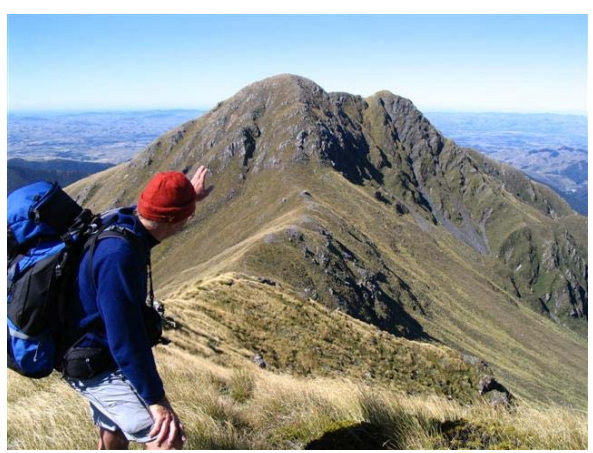
Murray looking towards Mitre

17 Tararua peaks - a good rule of thumb is to allow an hour on average for each one.