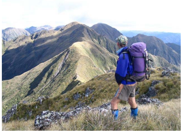
Warren on Logan looking south to Dundas

No time to sit for long - we had six further peaks to climb over before the end of the day. Walker at 1392m was very straight forward and not so much down. Pukemoremore (1474m) has a long rocky ridge and takes a bit of time, finally gaining views of Dundas Hut down to the east well below the peak near the bush line. A steep descent to a saddle and the cairn to Dundas Hut, up and over smaller peaks and onto Logan at 1500 m, straight forward, Dundas at 1499m towers beyond after a big dipper and looks a bit steep, a buttress of a mountain top, but the route heads a bit around from the east and is a easy walk to the Trig.