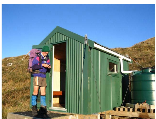
Warren at Arête Biv

Time to look back; we were going well, 5.00pm. Vodafone cell phone works from the top, so we checked in and reported on schedule. Arete was way to the south, a long walk over smaller peaks and I keep wondering if we had to climb Arete ahead at days end. We were able to drop to the eastern Arete bench from the ridge and the Arete hut looked ever so welcome by 7.00pm, 11 hours on the go. The wind was up a bit and the ventilation of the hut seems to make the breeze sound like a gale a sit whistles around the Hut. The temperature cooled quickly, time for soup, dinner and dessert, a raspberry instant pud with plain yoghurt, great. We were in bed by dark, time to rest the wary bones.