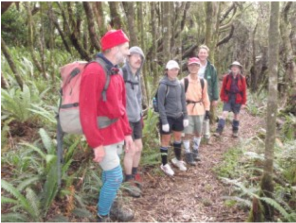
Tramping the Mangahao- Makahika track.

Views were scarce to the east, with only the occasional peep out towards the Mangahao Dams, but never actually a view of them. There were three cut lookouts to the west, which showed us some of the plains and foothills, and gave us a good indication of progress. At Archey's Lookout (about half way), we paused for lunch and to chat to some locals. It was from there that the vehicle drivers returned north, allowing the remainder of us to continue south. We crossed several attractive headwater creeks of the Mangaore, then Makahika Streams, all set in more open and regenerating tawa forest. By then, the track followed an old bush tramway line. Good campsights were numerous. Presently, we reached the farmland, and with it, views of from where we had been. Wet feet at the end hardly dampened our spirits to do this tramp again, and explore the area further.