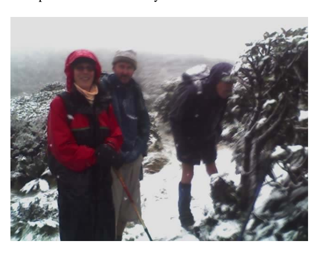
We could shelter under a little roof up at the Wharite mast and have our lunch, all the while noticing that

While we ascended huff puff the steep bit, still only wet on the outside of our waterproof raincoats, we scanned the sky, and sure enough at 735 metres altitude the rain started to change colour from seethrough to white. While we sloshed over the ridge and were sheltered from the wind by the leatherwood, more and more flakes settled, and stuck their wet tongues out at us: nana na naaana. We slowly discovered why overcoats are never advertised as snowproof snowcoats. They ain't.