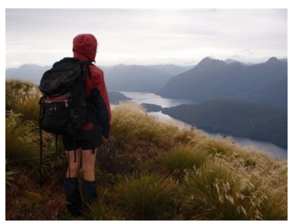
On top of Mt Forbes #3, Resolution Island.

With the network of predator control tracks Forbes #3 was successful ascended as part of a long day circuit including Mts Lyall and Clerke. A number of days were also spent in the centre of the island, again using DoC's excellent facilities; investigating the sometimes rocky, sometimes swampy, open scrub covered landscape and Mts Lot and Roa.