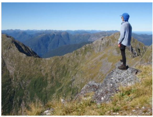
The view from near summit of Mt Forbes #2, Doubtful Sound.

The descent the following day down to base camp was executed relatively easily, with only one section of pack lowering with slings. Then it was onto the mountain radio, contacting the helicopter operator, breaking camp, then a late afternoon transfer to Resolution Island.