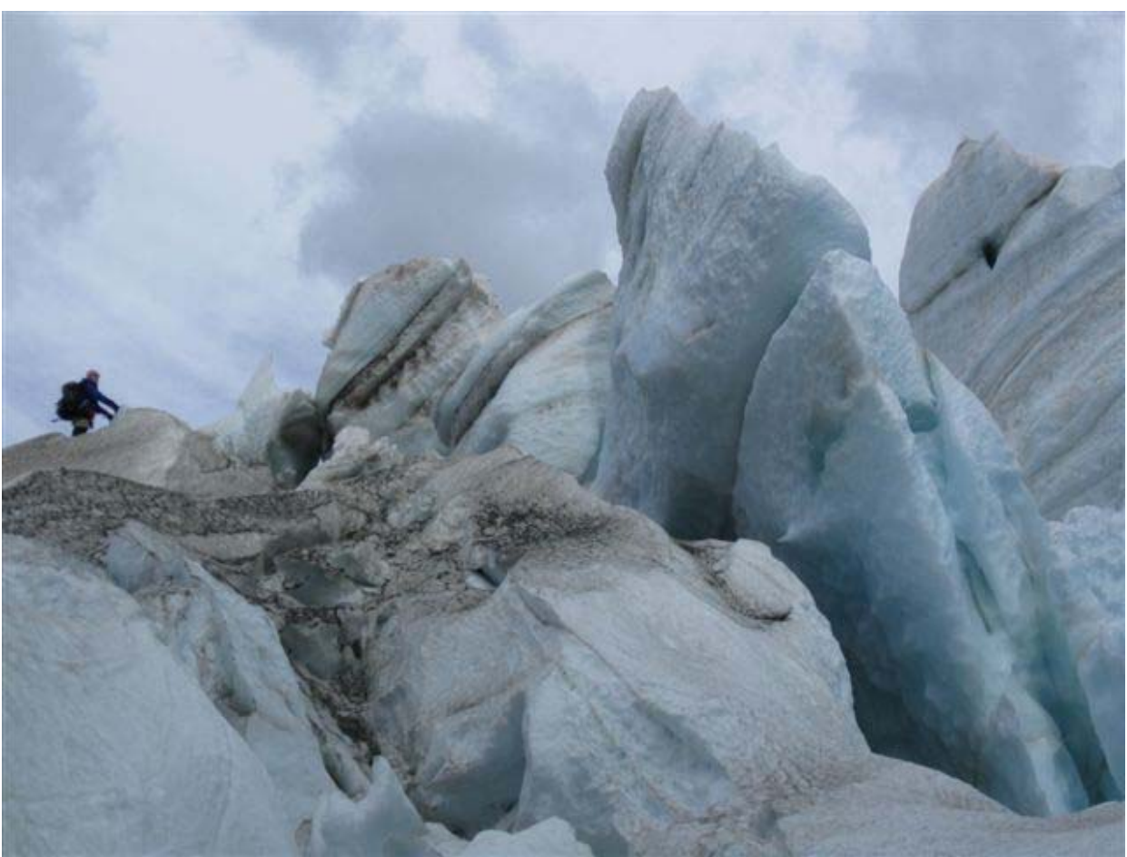
Impassable icefall approach to Mt Forbes #1, McKinnon Stream Godley Valley.

However there was far more white ice on the Ballium snowfield which presented quite a bit of step chopping on the steepest part of it on our descent. Getting back to the vehicle, parked further down valley was not without its problems. Rain and wind had set in overnight and became impassable. Separation Stream Fitzgerald Stream up valley was impassable, so shelter in Godlev Hut was cut off. Nothing for it but to set up the tent and wait it out. Two days later, with breakfast consisting of one biscuit each with a dollop of butter, jam and marmite, we managed to get across Separation Stream and get back to the vehicle. By this stage we were overdue by two days and a SAR operation had been initiated. Fortunately action had not progressed past the paperwork stage since all relevant information had been forwarded to the Tekapo Police by our overdue contact and knowing what the weather had been like, the Police rightly assumed we knew what we were doing, would be safe and just sitting it out. Once out to Tekapo we called into the Police station for a debrief before heading off to Fiordland.