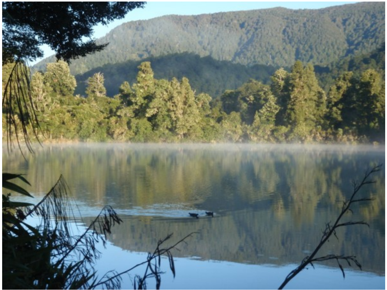
Relatively tame whio on Lake Colenso / Kokopunui. Note heavy Podocarp forest, and Ohutu Ridge on the skyline.

Down in the Mangatera River, we explored the river downstream from the rock barriers we had encountered the previous day. It was an easy splash and scramble through a small, cliff lined gorge to the Waiokotore confluence. I knew the river from there, but it still felt like exploration as we wound down valley. Towering cliffs and slips above us, a few small grassy river flats, and two more short semi gorges made the route very interesting. We disturbed two more whio as we splashed our way along. A leisurely five hours,