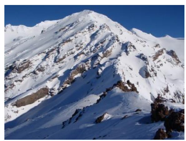
The East Ridge of Ringatoto from pt 2123m - winter

The other east ridge is on Ringatoto (Mitre) on Ruapehu. This is accessed from the Tukino Mountain Rd and the RTM Track. It is best done in winter using Rangipo Hut as a base. This autumn a couple of us tried it, a very late start after a dawn service on ANZAC day, accessing the ridge by heading up though the bluffs on the true right of the Whangehu valley. Once on the ridge proper it is difficult to pick out which side of the various gendarmes it is best to sidle past and the most of the route is on loose rock rubble. So as a summer route – Not Recommended.