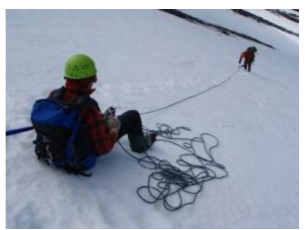
The business of mountain safety on the PNTMC Snowcraft course on Mt Ruapehu.

Fees: For each of SC1, SC2, SC3: $40 if PNTMC member or $50 if non member. These cover weeknight venues, day transport, group gear hire, and instruction. Individual gear hire, if needed, is an additional cost for non PNTMC members. Pass the word round to friends you may think are interested.