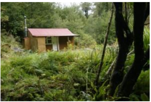
12 May, Iron Gate Hut, Oroua Valley. They bagged all Oroua huts in one day.