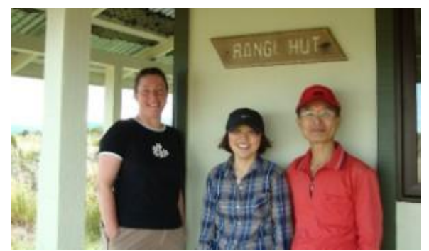
At Rangi hut