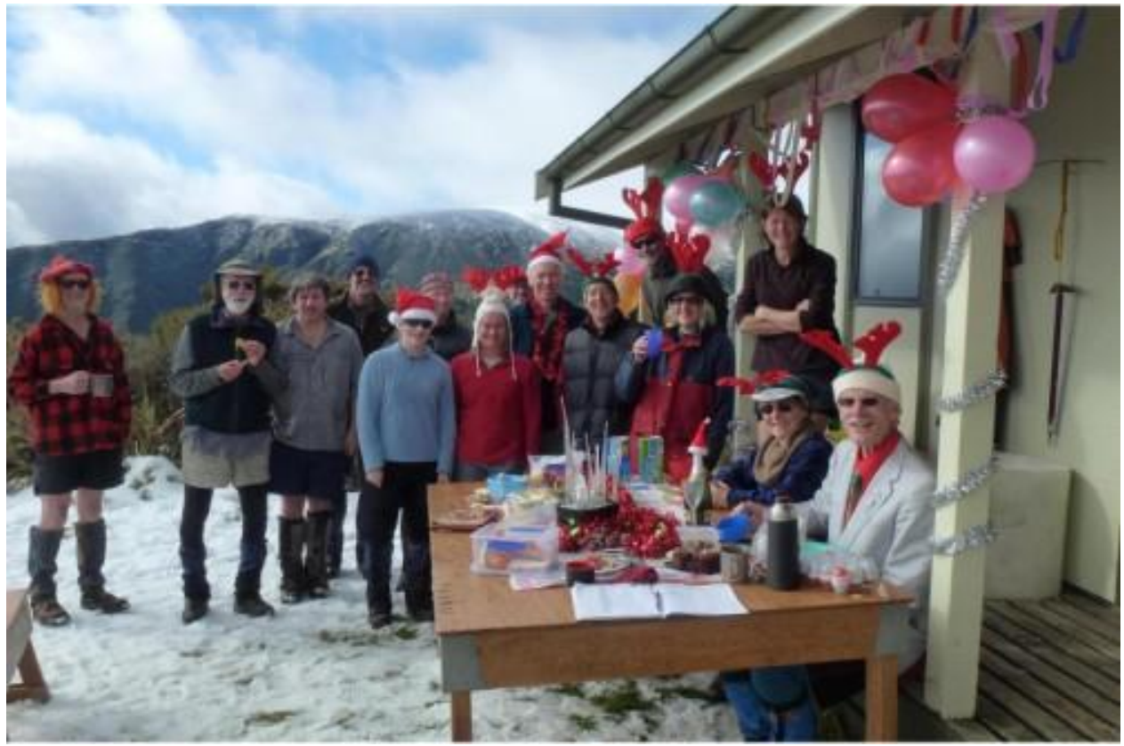
A well fed and impeccably dressed PNTMC at Rangi Hut

Thanks to everyone who came and enjoyed a most excellent mid-winter trip - good company and Rangi Hut was a great destination that suited both day and weekend trips.