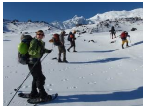
Snowcraft 2011, Whakapapa