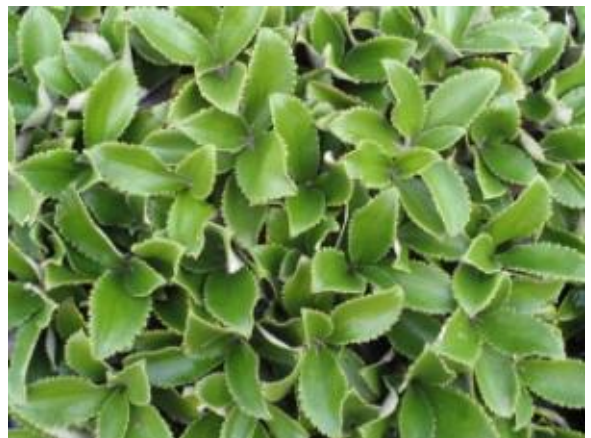
Impenetrable Ruahine leatherwood, which grows in profusion at Wharite and Takapari Road. It is much worse than supplejack to tramp through

Warren and I went to Wharite Peak travelling in his interesting looking and comfortable car. I could see that it was quite foggy in some places as we passed by in the car. When we started walking there were cloudy skies but no wind. It was an interesting feeling to realise suddenly being above a massive amount of cloud where it was just sunny. We had lunch near the satellite towers before coming down. Some places were muddy near the top but it wasn't too wet. The cloud followed us and the skies became grey late in the afternoon.