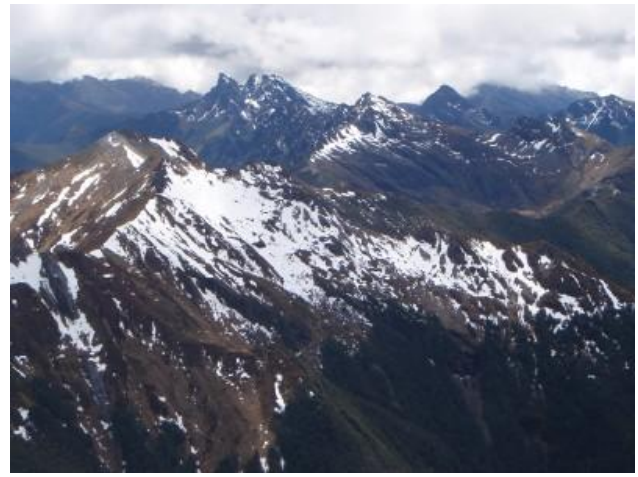
The view north along the Douglas Range towards Lonely Lake, The Drunken Sailors, and The Dragons Teeth/Anatoki Peak from the summit of Kakapo.

Once we departed from the route to Lonely Lake it was an easy snow scramble up onto the summit of Kakapo where we had lunch and plenty of views; across to Lonely Lake, the Dragons, and Lake Stanley below us. Returning the same way the weather had improved greatly, all the fresh snow on the forest had gone; so it looked promising for our walk out the following day.