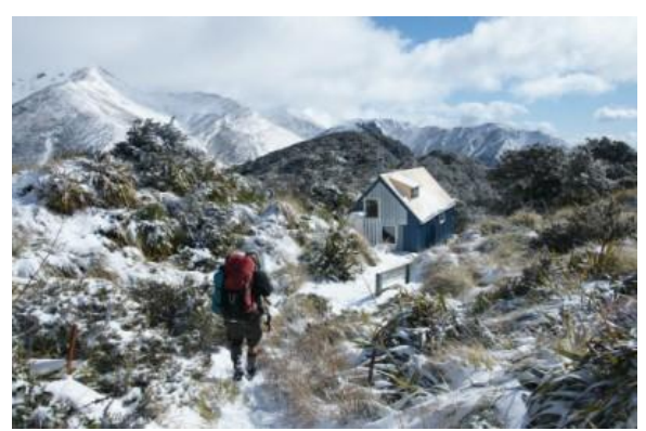
Howletts Hut, central Ruahine Range

The wind did not abate, but the hail did stop, and thus the descent back down to Daphne was comparatively pleasant. Just before the hut, the heavens opened up and soaked us. We contemplated going up to Howletts for the night (we still had enough time to do this) but the weather really put us off leaving Daphne. The hail/snow/rain continued well into the night.