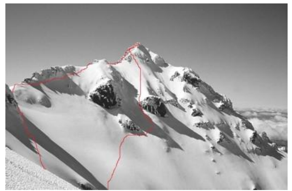
The beautiful mountain: Girdlestone Peak, Mt Ruapehu, and the route followed.

It took about five pitches and quite some time before I reached a difficult section near the ridge leading to the top. There was soft snow in channels between hard ice that was easily broken. I set up a belay in a rather uncomfortable position and waited for OJ to come up. He came past and set up the next belay about 10 metres from the peak.