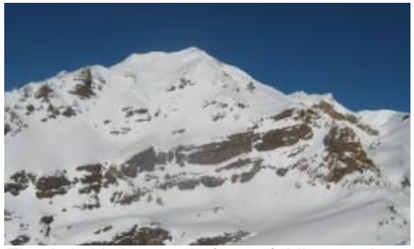
The intimidating north face of Mitre peak, as viewed from Whangaehu Hut.

Once across this we returned to the ridge, pushing on ahead as quickly as we could. By this point the temperature was dropping, the wind picking up, and the sun only just above the mountain, so we started looking for an escape route. There were a number of snow slopes down, but we couldn't see the bottom and were worried there would be small cliffs so we pushed on to the lower summit when we finally saw a good route. By this point the sun was just dropping behind the mountain.