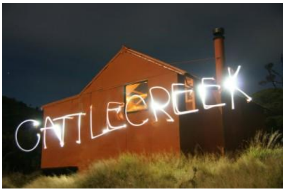
Cattle Creek - an exercise in writing backwards. By Chris Tuffley

In future, the PNTMC photo competition categories will be aligned with those at FMC. The winners will be sent to FMC for their 2013 photo competition. The FMC categories set out below were used for the Interclub Competition: