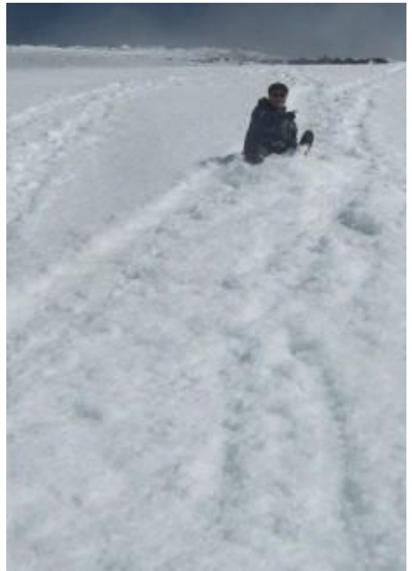
Woody bumsliding the slopes

It was cloudy, but they cleared once, giving us the chance for a few photos of Tama lakes. We also got some good views of Tongariro. The crater itself was very icy, the ice looking almost like small flowers. Warren and Woody decided to remain on the lower summit and explore the fumaroles while I cramponed around the crater rim, getting some good views of its overhanging ice walls, then joining Woody and Warren at the fumaroles. We then started our descent moving down more to the north-east. The long steep snow slope looked too tempting and we soon gave up walking and tried a glissade down.