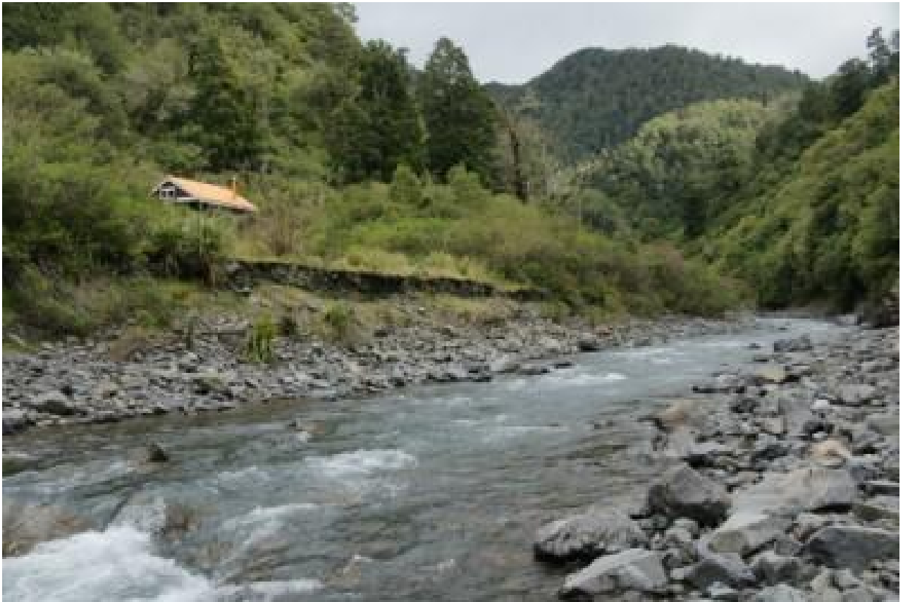
Barlow Hut and the Makaroro River

We got up to the biv and immediately started getting cold again. There was a light dusting of snow on the tops and at the biv. We retreated back down the ridge and crossed the farm to the car. In the last 15 minutes of the tramp the rain finally started, but we ended the day mostly dry apart from the boots.