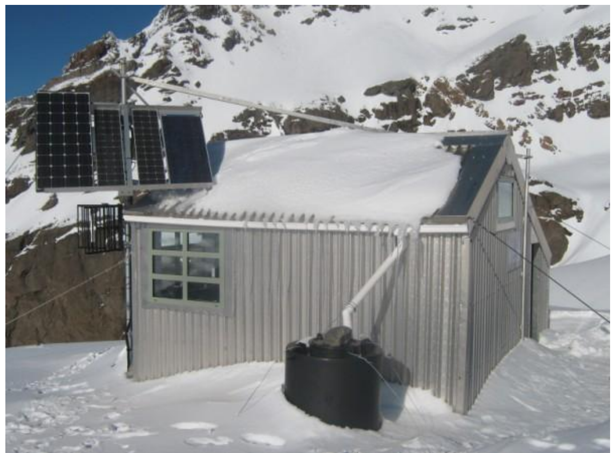
The welcome Whangaehu Hut (NZAC), Tukino side of Mt Ruapehu