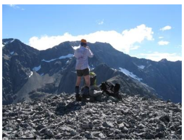
On the summit of Moki; Mts Duessa, Una and Glacier Gully directly behind.

The next morning the tops were covered in cloud and the wind continued, so not much action till about 10am when the cloud lifted. We thought we may as well give Mt Moki a go being on a side ridge and lower than the other two peaks. This meant we could also check out a steep gully for access onto the bench. This gully while very steep was an excellent route up onto the tussock and rock fields. The singular waterfall is bypassed on the TL via a fault zone gut. Once on the easier slopes we scrambled up onto Peak 1879m for a late lunch.