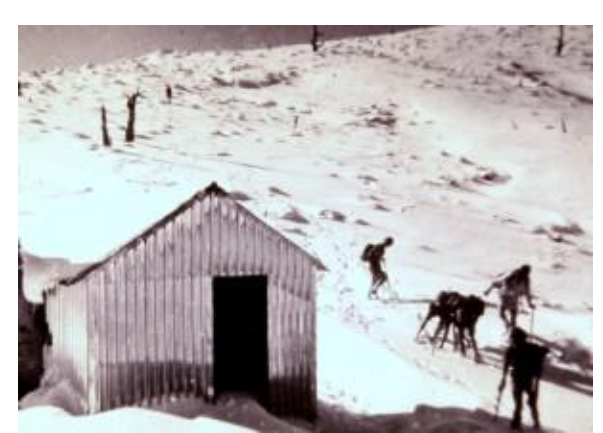
HTC at Pohangina Saddle "The Tin Hut, 1961