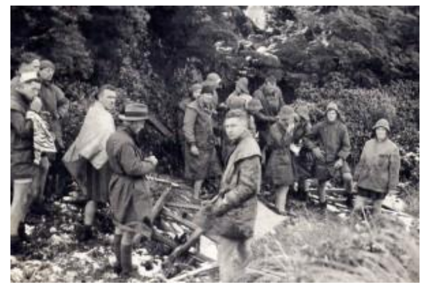
HTC at Howletts Hut site, 1936