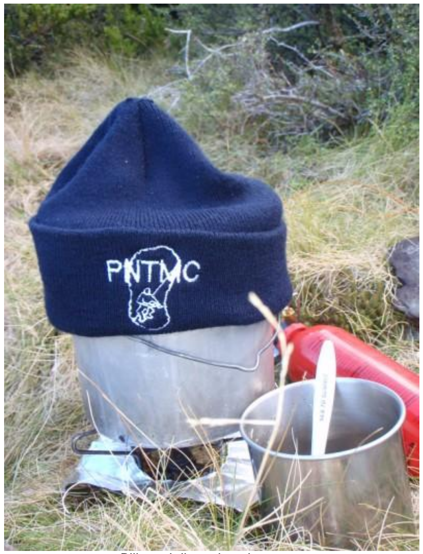
Billy and dinner keeping warm.