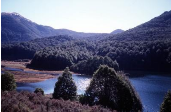
The gorgeous Lake Jeanette, upper Matiri Valley

The northern end of the South Island has great tramping areas. PNTMC periodically goes there, to places like the Thousand Acres Plateau, located along side the Matiri Valley in from Murchison, and adjoining the Wangapeka Track. During perfect weather during October 2000, a few of us explored the Thousand Acres Plateau, and the adjoining plateau known as the Devils Dining Table. We climbed the peaks named Haystack and Needle (NB a different peak to "The Needles Eye" mentioned in the trip report earlier). It was a scrub bash down to the beautiful Lake Jeanette, where the historic hut named Hurricane Hut is located. It's a wonderful, if earthquake scarred, landscape.