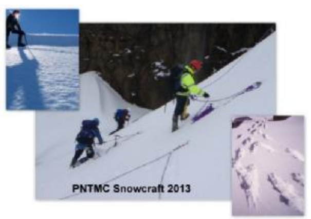
Snowcraft scenes 2006 and 2013 at Whakapapa, Ruapehu

Winter has arrived! PNTMC's Snowcraft Programme starts earlier this year; to give you more time to use your skills over winter! It has two aims; to equip people with the necessary skills for safe tramping in snow; and to pass on the fundamental skills of mountaineering. It will be running as day trips to Mt Ruapehu with an evening session mid-week prior to each day trip. Dates are: