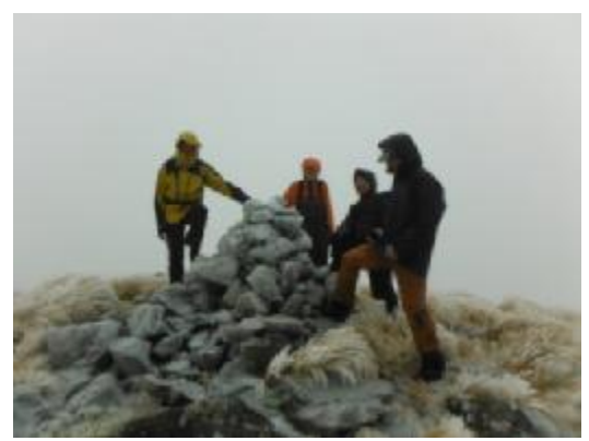
Chilly day on Mitre Peak [Woody Lee]

southerly drizzle bluster. Precipitation seemed to lessen the higher we went. A tail wind helped us up the cairned route to ridge line. Cool. Visibility 273m (approx). Time to put on leggings and warm gear (gloves, hats, jacket). Individual wrappers for sweets found to have mice nibbles. Sweets untouched, but. Soon pass first build up of snow flurries along track. Then ice coated snow grass bent north by the stout breeze. Ice flowers built up on dry heads of daisies. Brushed by and broke through overhanging icy snow grass along entrenched track. Estimated 30 knots on Peggy's Peak. Dropped along track to leeward for a quick nibble to refuel before final summit push. Tail wind helped crux move across short narrow ridge. Little ice, rocky underfoot, easy few minutes stroll to the big cairn on Mitre Peak. Team photos, cap blew off but didn't get far.