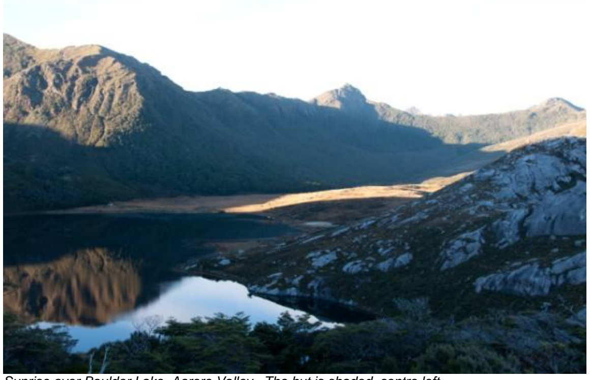
Sunrise over Boulder Lake, Aorere Valley. The hut is shaded, centre left. Note "The DragonsTeeth", the rock spires on the distant skyline