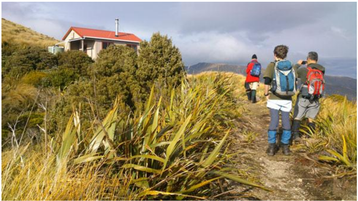
Approaching Purity Hut, north west Ruahine Forest Park.