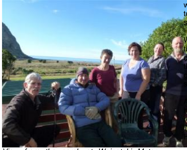
View from the porch at Waipataki Motor Camp.