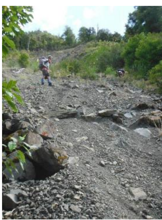
Carefully crossing the Otukota slip.

Scrambling up the hill was a bit of challenge, and the three of us behind Warren needed a few stops to catch a breath, but Warren showed no signs of slow down. Once we reached the top of the hill it was easy going, then time for lunch and an opportunity to enjoy the stunning views.