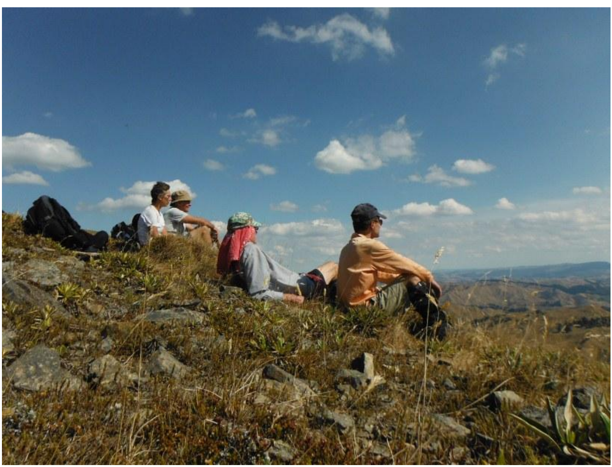
Enjoying the view west from the Mokai Patea Range - Otukota Trip - 24 March 2013 [Woody Lee]