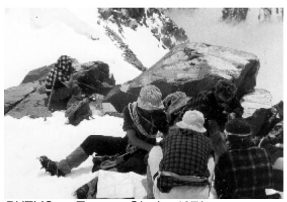
PNTMC on Tasman Glacier 1970