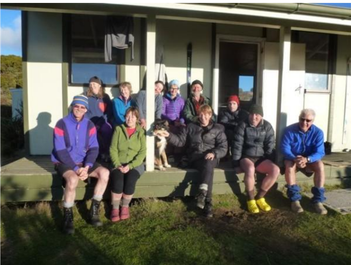
PNTMC and Heretaunga TC members enjoy the late afternoon sun on the combined trip to Rangi Hut.