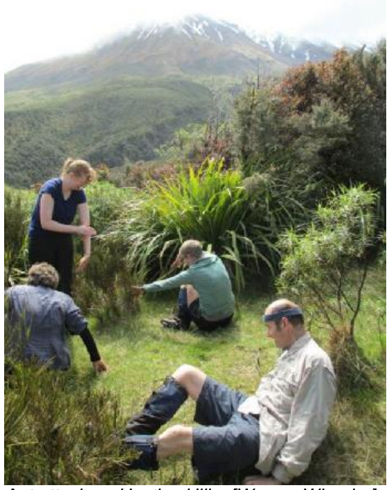
Ant attack on Hasties Hill [Warren Wheeler]

After a change of plan due to the poor forecast, I was relieved to hear we were not actually fly camping and excited to get up close to Mount Taranaki. First view was from the Water Tower in Hawera where we stopped for some supplies (Apple pie and Afghans!). On the first day we headed up Ihaia Track (an old bush tramway) to Waiaua Gorge Hut. After a fairly easy river crossing we arrived, then carried on without our packs, up to the Brames Falls Lookout. On the way back the weather decided to turn and we were glad someone had already got the fire going.