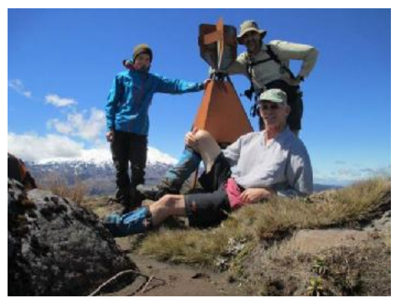
Hauhungatahi peak baggers [Warren Wheeler]

After struggling through the dense scrub we reached the ridge and headed along the top of the ridge. Generally it was easy going but after about 10 minutes we came across the track and had a good walk up to the bush line and then across the open and gentle rise to the peak. After the obligatory photos we headed back down. The track down lead us back to the first stay we had passed.