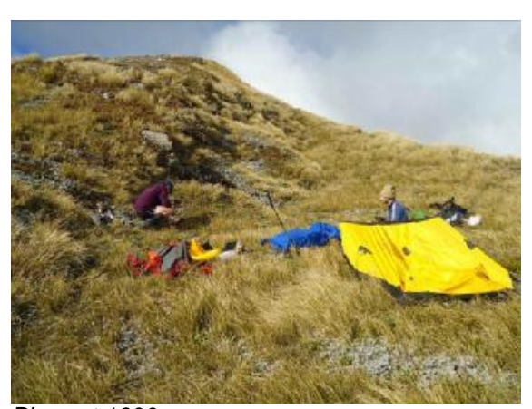
Bivvy at 1600m

The bivy was mostly good, but the rain came again and wetted all our gear. The rain, however, was short lived and we nonetheless had plenty of pleasant weather to enjoy the views. Sometime during the day, Paul lost the poles to his tent (probably that wretched bush section out of Sparrowhawk). The tent was used as a two person bivy bag for Derek and Paul. I had my own bivy bag.