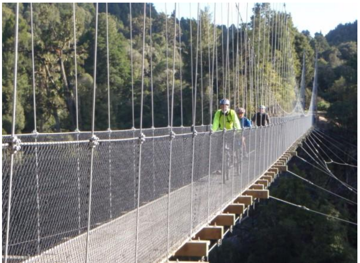
Cycling the big suspension bridge across the Maramataha Stream, Timber Trail, Pureoroa Forest Park. It is 141m long, and a spectacular 53m above the stream. [Terry Crippen]