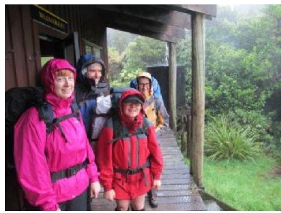
Leaving Waiaua Gorge Hut

After a pretty stormy night with rain being hurled at the hut, we headed back down the track to the car. Parked up at Dawson Falls visitor centre and after a look at the falls, set off along the Lower Lake Dive Track.