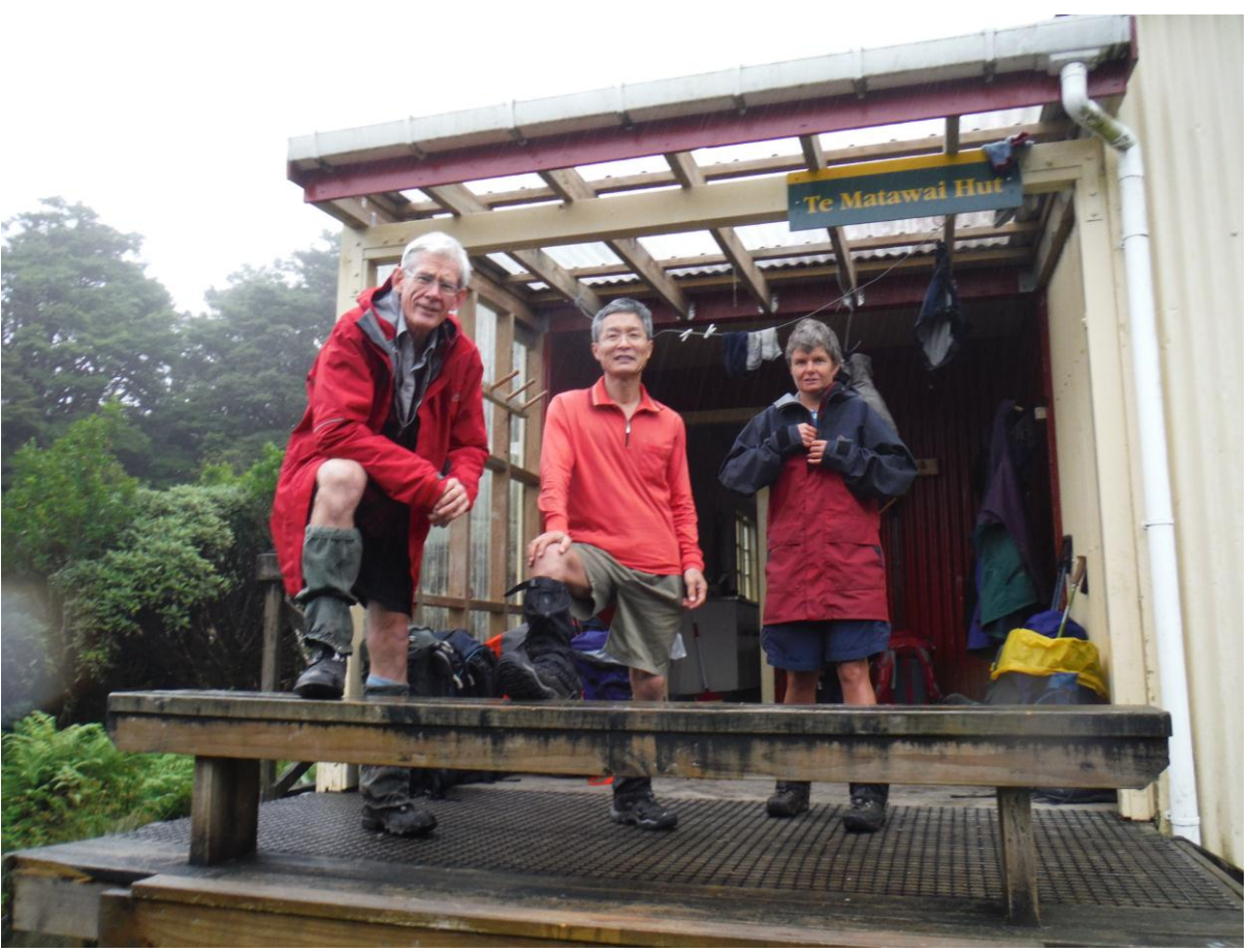
Ready to leave Te Matawai Hut, the Tararuas