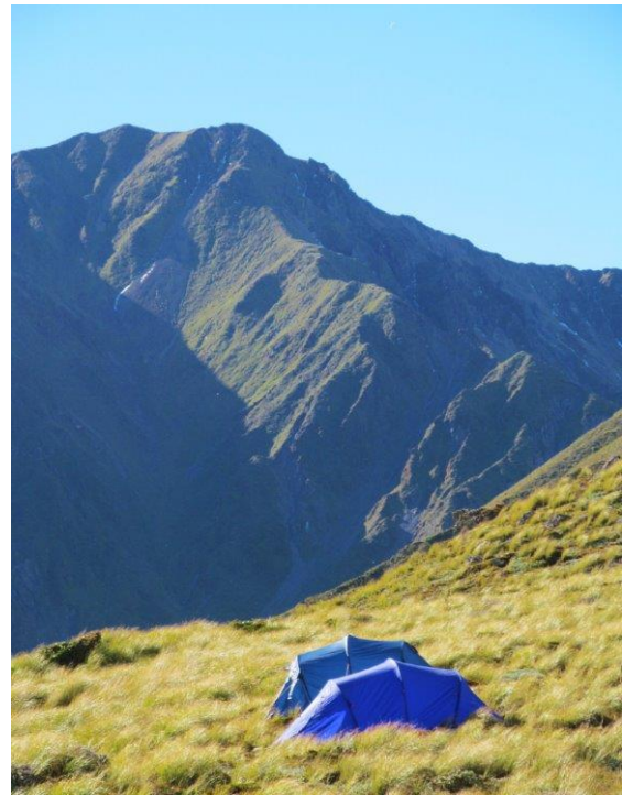
Camping on the tops.

After tea we all sat along the edge of the ridge in the evening calm watching the sunset, then headed off to bed anticipating a great sleep and an exciting day tomorrow.