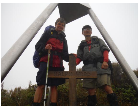
Twin Peak Memorial Trig

A little way down the hill, we came to what I assume is the original Ralph Wood memorial cross. It had stopped raining, but was misty, with no views. The next peak was Waiopehu, then after a small patch of bush, we arrived at Waiopehu Hut, where a lone possum trapper was just leaving to ply his trade.