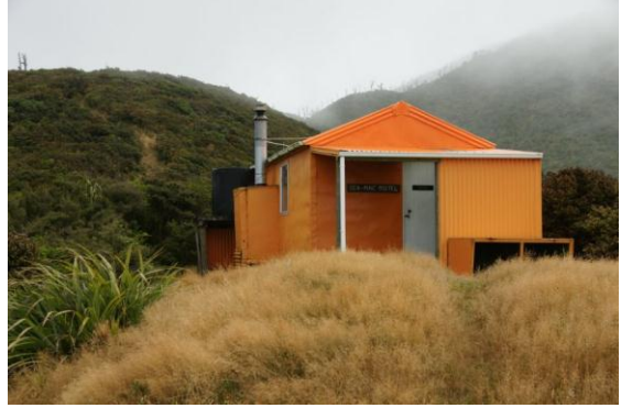
Kiritaki Hut, Ruahine Range [Chris Tuffley]

The weather lower down had been cloudy with some sun, but now we were in the clouds, and remained so for most of the rest of our stay. The hut is apparently a classic New Zealand Forest Service hut, painted in regulation bright orange, and boasts all the essentials, and even some luxuries (soap! Toilet paper! magazines!).