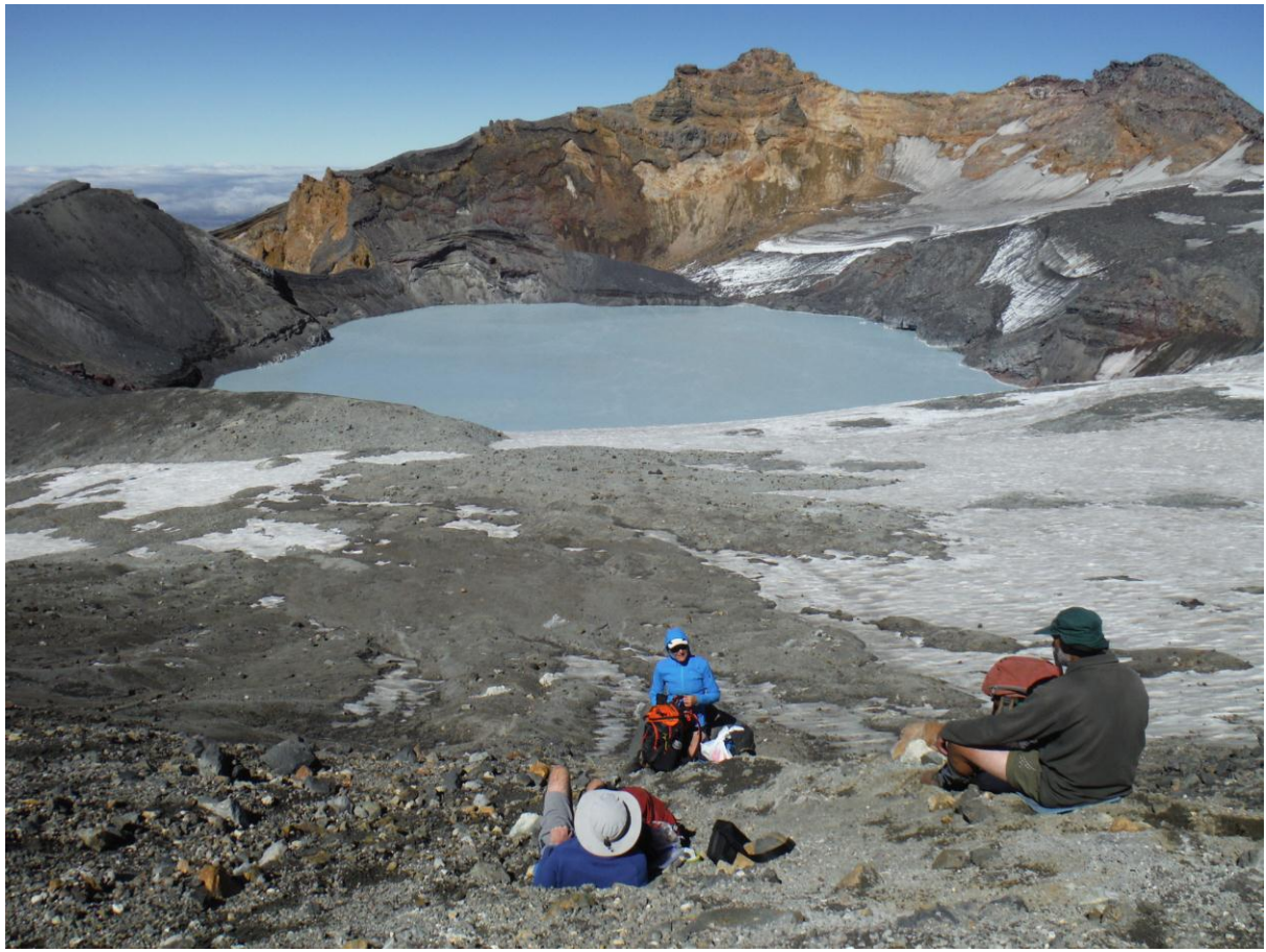
Lunch at the crater lake, Mount Ruapehu