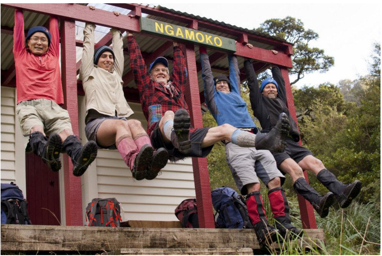
PNTMC hut maintenance team hanging out at Ngamoko - retake of a classic photo [Martin Lawrence]