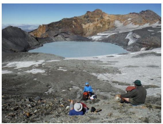
Lunch at the Crater Lake [Warren Wheeler]

We started with a leisurely explore of the Crater Lake and the nearby crevasse. The lake was a particularly lovely blue with occasional drifts of sulphurous fumes. Then we headed off to Cathedral Rocks. A quick check of the GPS helped identify the highest point (2663m) which proved surprisingly easy to clamber up. From this vantage point, Glacier Knob seemed to be crying out to be bagged. This required us to cross the plateau which looked flat from above but proved to be pocked with many quite large depressions. Despite this it was still an easy saunter across the tussock and alpine vegetation. Glacier knob (2642m) is part of quite a long ridge and there was some debate as to where the actual top was. As we were debating where the actual top was, a mountain runner appeared from below. I explained to him we thought we were probably at the top so he helpfully tried to explain that the actual top of the mountain was a bit further on! At that stage I decided it was just not worth trying to explain what I had meant by 'top'!