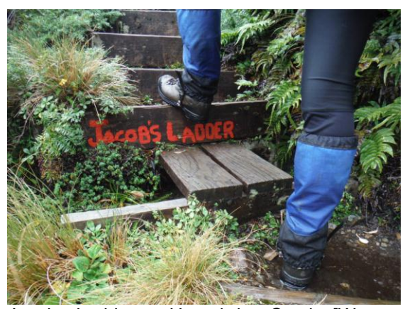
Jacobs Ladder to Humphries Castle [Warren Wheeler]

Lunch was at the deserted hut - Mmmmmm do we stay here or bail back to the car? It was so early, but we decided to stay and entertained ourselves stocking the wood basket with kindling and coal and lighting the fire. The Easter Bunny delivered to the hut thanks Warren. A couple of women arrived and then four keen young guys whom were intending to summit the Mountain the next day - our entertainment for the night. As the hut is only just over an hour from the road end it is easy to carry in copious amounts of alcohol, large square cookers and food for a dozen kings. Another young couple arrived also and cooked a meal that put our dehydrated meals to shame.