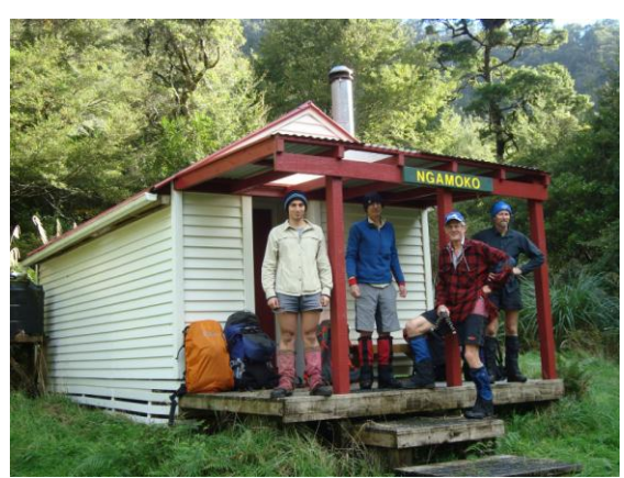
The team posing in front of Ngamoko [Woody Lee]

The big job on Sunday morning was removing and replacing the broken toilet door hinge, with the minimum of tools. Full marks to Warren for bloody-minded persistence with a Swiss army knife and to Thomas and Craig for forceful screwdriver work.