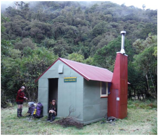
Penn Creek Hut

The hut is well looked after by VUWTC who at the end of June had a dozen in for some maintenance and clearing vegetation from encroaching. Most of them blasted off downriver to Otaki Forks so despite some "hard work" stories in the Log Book the old Penn Creek Track (or river route, or a bit of each) is quite doable if you are suitably experienced and fit (and crazy?).