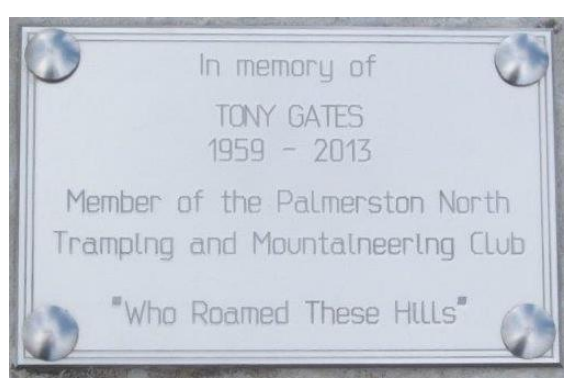
Stainless steel plaque thanks to Mike Leyland.