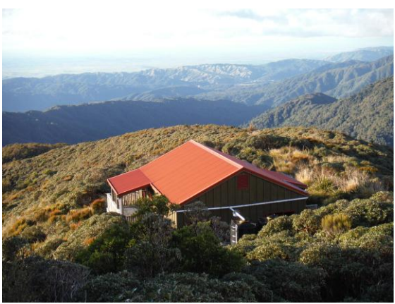
Waiopehu Hut offers great views

Unanimously a decision was reached to head to the top of Waiopehu (1094m), but not until Kathy had her cup of tea, so I put the billy on and we all had a hot drink before heading off. It didn't take long to get to the top where we were able to enjoy views of the surrounding area.