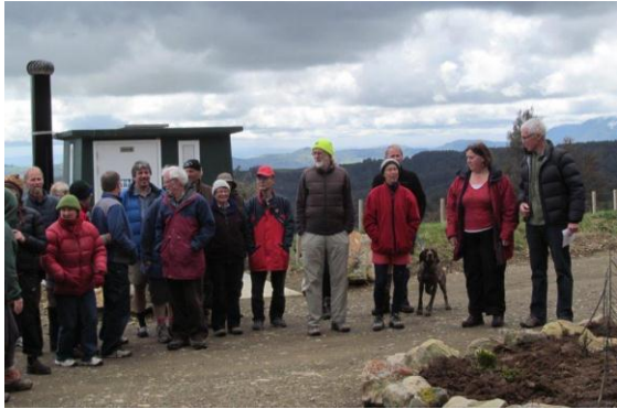
About half of those attending