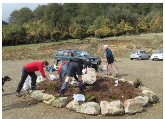
Initial planting out