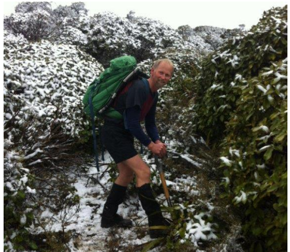
Collecting plants from the leatherwood belt.