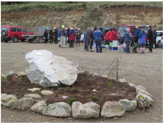
Lunch and drinks followed