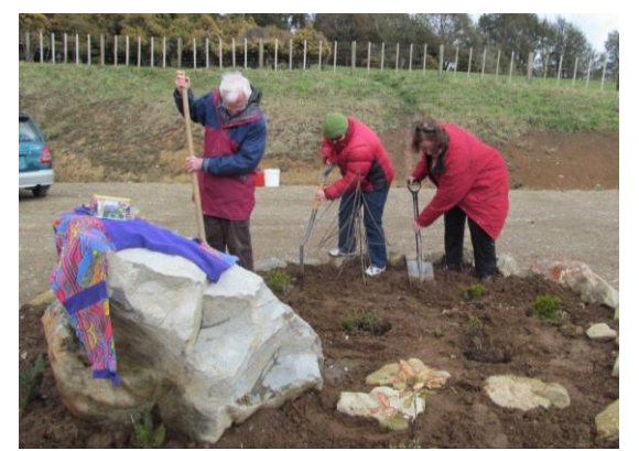
Final planting by Gates family members