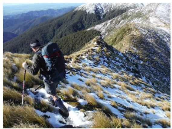
Dropping off Jumbo towards Mt Holdsworth.

Mostly the rocky track was clear of snow, except occasional patches, and with little wind it was near perfect conditions and we took our time, with lots of photo stops and morning tea break spent lounging in the sunshine in the sheltered low point of the ridge.