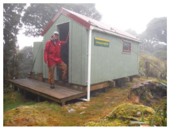
New Aokaparangi Hut in the cloud at bushline

The sign on the ridge said 20 minutes down to the Aokaparangi Hut, but it would make a good place for lunch and the tail wind speeded that up somewhat. The new 2 bunk hut is easy to find on the edge of the bush and had a couple of guys staying overnight. Their Log Book entry said the weather was too bad to carry on through to Maungahuka and over the Tararua Peaks to Kime Hut so they were retreating to Andersons and YTYY the way they had come in. Good call but by the time I got back up to the ridge again the wind seemed to have dropped a bit and only threatened to blow me every now and then instead of every so often.