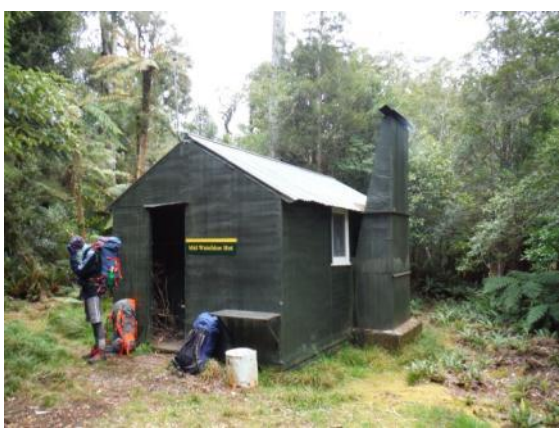
Mid Waiohine Hut

The rest of us duly set off – the Parawais were heading across the river and straight up the spur onto the tops along to Anderson Memorial Hut and down to YTYY. I took the track downriver to cross the bridge and follow the track up to Aokaparangi. It was indeed quite breezy on top but no real rain to speak of, despite being inside the cloud and the odd horizontal blasts.