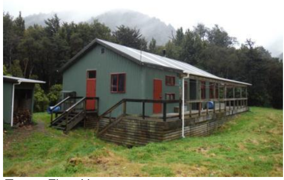
Totara Flats Hut

As the track starts to descend steeply to Totara Flats there is a surprising lake section that slows progress briefly. Finally reaching Totara Flats Hut at about 1.30pm I found there was nobody there so I had a quiet lunch reading over the hut book and wondering if Totara Stream would be passable on my way out to Holdsworth carpark. It certainly looked to be up a bit where it joined the main river across from the hut.