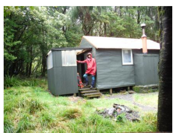
Neill Forks Hut

It started pouring with rain towards morning, and the river became a raging torrent. We waited for the rain to ease (as forecast) and sure enough it was only light drizzle when I left about 10.15am.