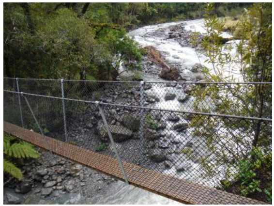
New bridge across Totara Stream

As I headed off to cross the Waiohine swing bridge I was met by my German (?) friend who had decided the Tararua Peaks route wasn't a good idea after all. I assured him that it was only about 2 maybe 2 and half hours and left him to his lunch break while I carried on. Fortunately there is now a new bridge across Totara Stream so getting out was no problem.