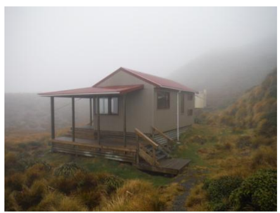
Maungahuka Hut nestled in the cloud

track often runs on the sheltered east side of the ridge, but it still took me four hours. The last long windblown ridge seems to take forever and I was down on my hands and knees a couple of times just to get some shelter for a quick rest.