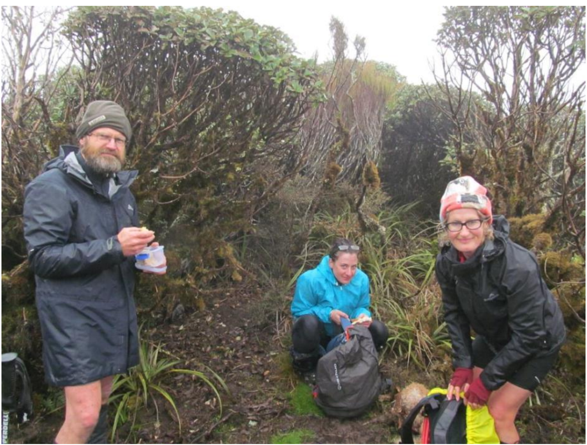
Leatherwood lunch break on Puketurua Track to Burn Hut.