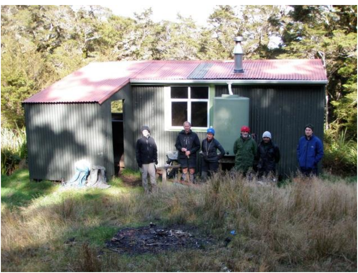
Bright sun at Kapakapanui Hut