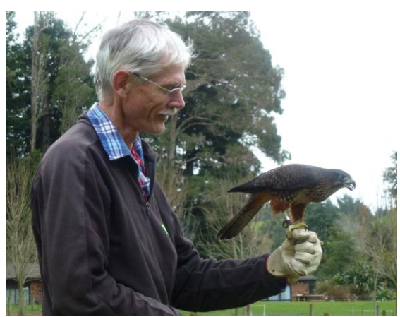
A bird in the hand

Monday the weather wasn't so flash. There was the option of heading straight back or visiting the Wingspan Trust. They put on a flying demonstration in the afternoon which would mean a bit of a late drive back. After a drive which included inspecting the DOC campsite at Lake Okareka and lunch at Redwood Park, we all headed out to Wingspan. Here they take in injured and such like raptors and either rehabilitate for release or, if that's not possible, house them. After looking around the avaries we had the falconry demonstrations. The birds are free flying and impressive to watch in action. All that was left was the drive home. Despite the holiday traffic, with a stop in Taihape for tea, this was incident free.