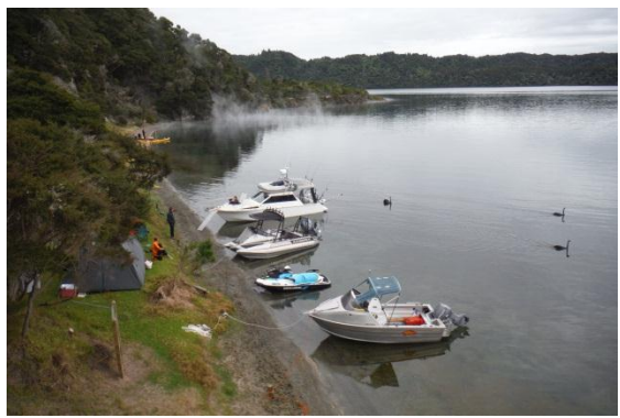
Te Rata Beach (hot water beach) [WW

I was interested to go back to the hot water beach. I'd canoed across there sometime late 70's or early 80's with PNTMC folk Colin and Chrissie Elliot, Ian Millar and Anne Flux. Then it was undeveloped and we canoed to take the track up Mt Tarawera. Quite a contrast now with little campsites marked out. Fortunately it wasn't full so we weren't cheek by jowl with other campers and people had the space to be friendly. Some chose to take advantage of the hot water which seemed to take a bit of temperature control.