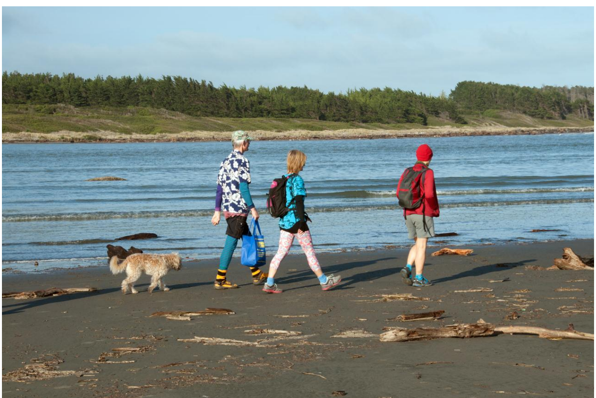
Foxton Beach walkers follow the Manawatu River down to the mouth