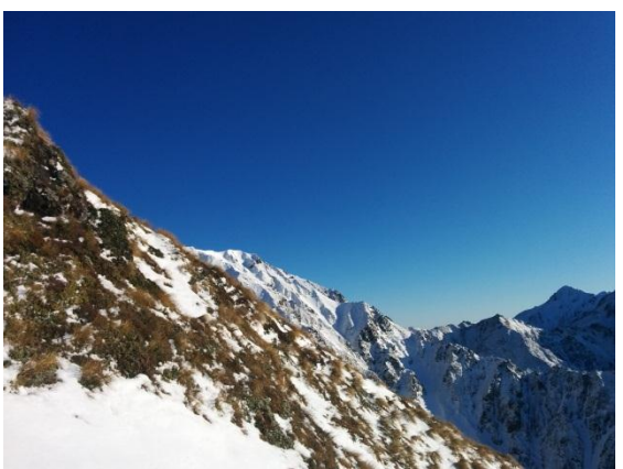
Northern side of Broken Ridge with 1673 to right

He explained the terrain and the way I should walk with reasons that boosted my confidence very much. I never looked at the cliffs beyond few footsteps except when we stopped for the break because I was so nervous. Eventually I gained the confidence and walked along. By the time we reached Hinerua Hut it was half past four. We had a break for 20 minutes and had a warm spicy instant noodle soup, oh God that was heavenly!! My pace was a little faster as I changed into lightweight shoes, however we soon had to switch on our head lights. We met up with two enthusiastic young hunters who were walking towards Hinerua Hut for the weekend.