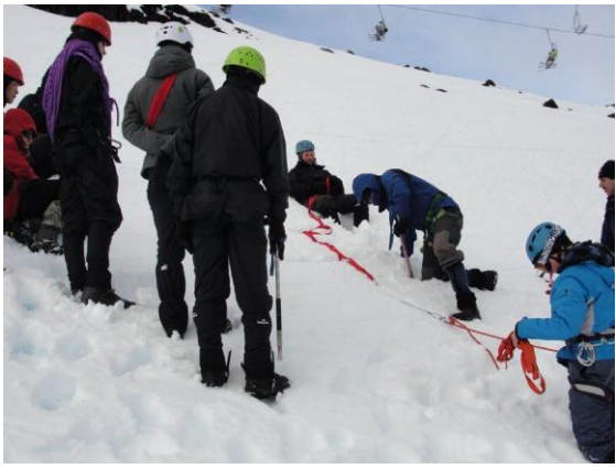
A snowpicket anchor