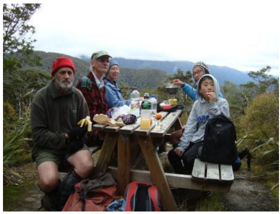
Picnic lunch at Blue Range Hut.

We made good use of a picnic table in front of the hut and enjoyed a long and relaxed lunch. A couple arrived soon after and we had a chat with them who were out for a day walk like us.