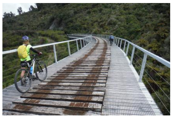
Old Hapuawhenua viaduct.

so you can catch your breath. After about forty minutes we come to a tunnel which is quite dark and you feel like you are going to crash into something, then you can see light and it stops abruptly with a wire cage. The cage is there because on the other side is the working railway lines. We keep going uphill through some nice bush and then under the newer viaduct where we can now see the old restored viaduct. This is a curved bridge and the sleepers have big gaps making it scary to ride over, it is also a long long way down when you look over the side to the bottom.