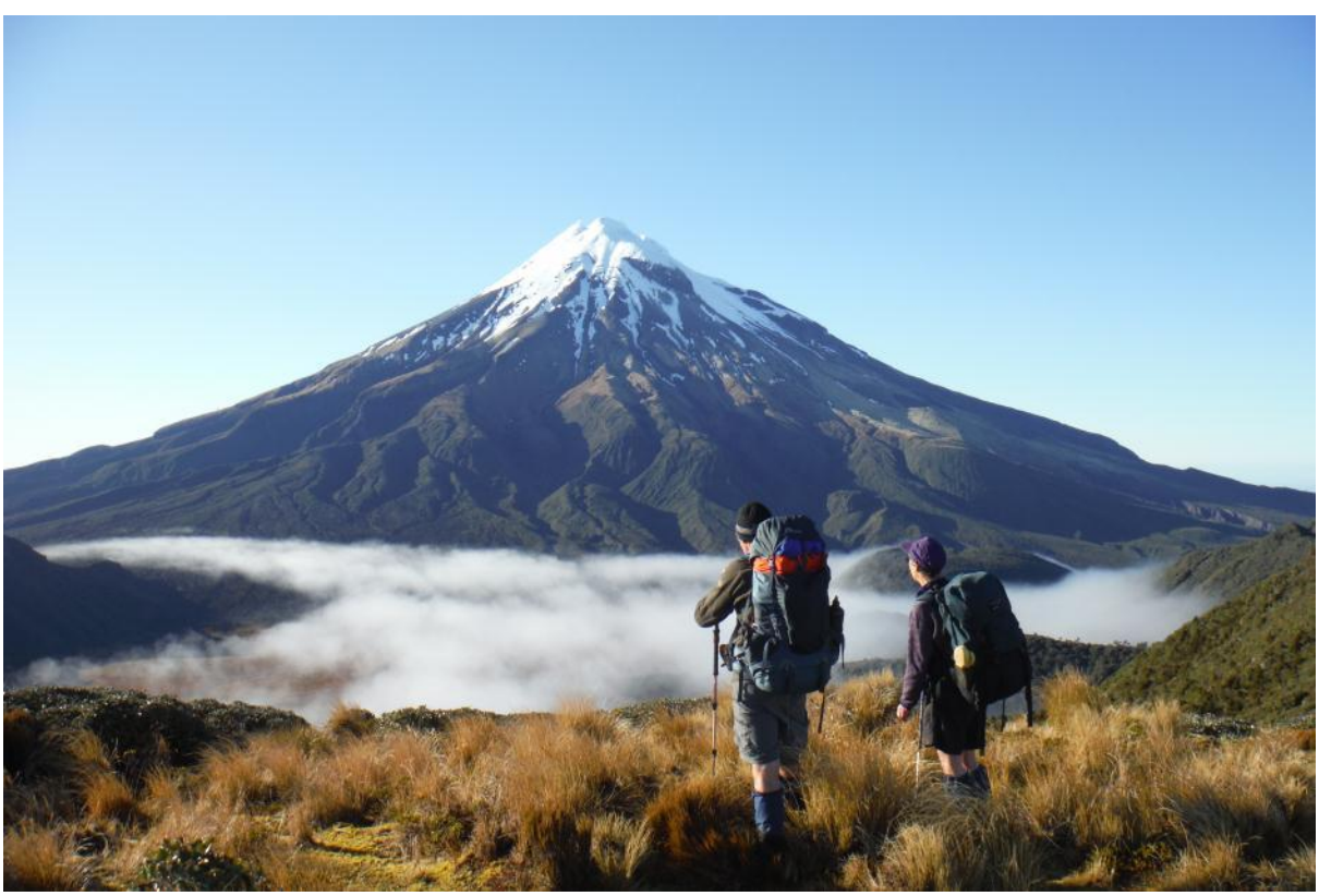
Poaukai Circuit – morning cloud cloaks Ahukawakawa Swamp below Mt Egmont [Warren Wheeler]