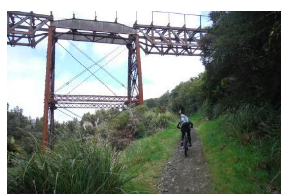
Under old Taonui viaduct to lunch stop. [WW]

We waited for a group of guys to come down the track as we were sort of doing the track backwards (most people get transported to Horopito and ride one way to Ohakune) then it was another hard slog uphill on a narrow track through trees with a rewarding downhill, but we had to be cautious about riders coming the other way. After quite a lot more up hill we came to another old viaduct which we rode under and then the track took us up to a lovely picnic lunch spot the same height as the viaduct. Although you were cautioned not to walk on it Warren posed for a great picture.