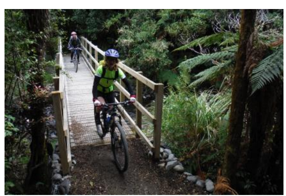
Down across bridge before up again.

The ride back is easier as it is mainly down hill but wow is it bumpy when you are flying at high speed and also not knowing whether to brake at the next corner or risk it!