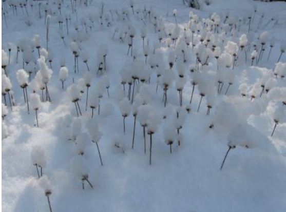
Celmisia in snow