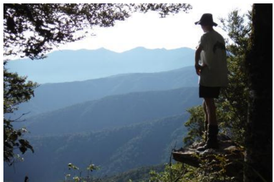
Tararua Lookout [Warren Wheeler]