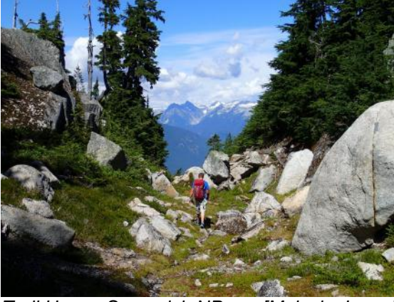
Trail Home, Squamish NP [Malcolm Leary]