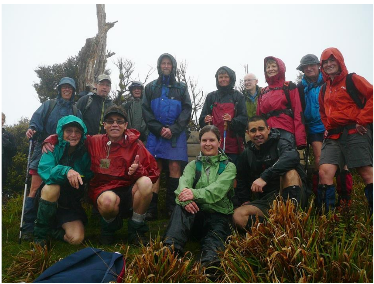
Jubilee Celebrations Trip up to the View Point at No. 1 Line