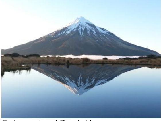
Early morning at Pouakai tarn

down to the tarn to take a few classic reflection shots. The track was very slippery and I nearly came a cropper on a number of occasions. It was fantastic watching the sunrise, far better than watching the rugby!!