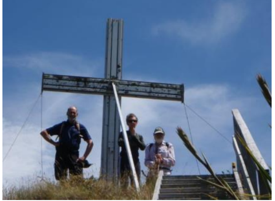
ANZAC Tinui Cross

Off up recently planted areas in native trees then through a pine block (and some FRI trails), then onto some farm land –more gale force winds - then into a QE2 covenant area and a good track. A rest before the steep climb on hard sandstone (people go rock climbing on the slabs, but it's a bit hard to put in protection). Once on the ridge, a bit of a farm track, for access by vehicle for ANZAC events. Then onto Maunsell, the second beaconed trig – at least there are a few left. Then over to the ANZAC Cross with good views down to Tinui and about.