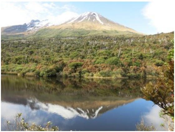
Reflections at Lake Dive

There was no-one at the hut when we arrived. Warren took a brief dip in the shallow lake and I took photos.