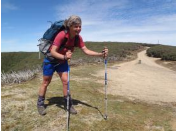
Enjoying the stiff breeze on Takapari Road.

We arrived at Tamaki West Road End to only one other vehicle in the carpark, and a cold wind. We left the car just after 9am, and soon warmed up climbing the hill. The track had been trimmed recently, and was in very good nick. In an hour and a half we had reached A-Frame, and while it was still in a dilapidated state, I was pleased to see that at least someone loved it enough to patch up the broken windows. Warren picked up some rubbish from inside the hut, and we carried on.