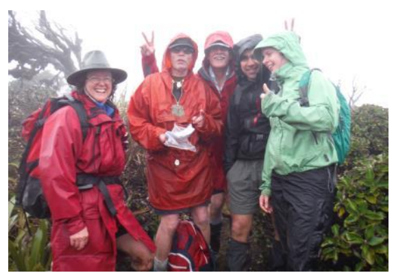
Social climbers on 1011 looking for a view

We had lunch in ghostly looking bush, or what Sue P. called, a "Gnome Forest". After that, six of us separated and went on for another 30 minutes, while the rest headed back. We were pleased to reach another viewpoint higher with even less view!