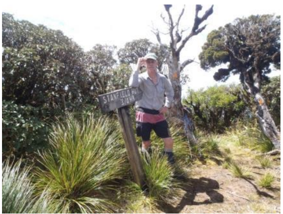
Signpost down to Stanfield

reminder of the cold snap on Wednesday. Nearer the track turnoff, there were fantastically clear views of the three mountains: Taranaki, Ruapehu, and Ngauruhoe. This turnoff on to the leatherwood track was the windiest bit of the whole walk, but it was still easy to stand upright.