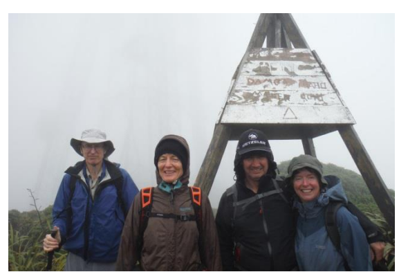
Wharite trig in the view free clag

We had lunch in a sheltered spot close to their scaffolding, out of the rather chilly wind. Warren had carried watermelon up for us all to share.