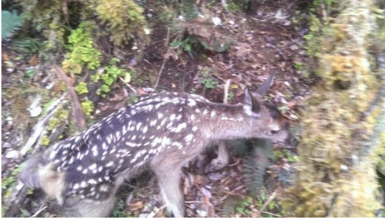
Fawn under foot finally heading away

After scrambling for almost two hours in the leatherwood we came to an area with different trees. There Derek spotted a new born fawn and he predicted it could be a day or two old. It was lying down in an awkward position as if it was injured and could not walk. Derek suggested that I could carry the fawn home and rescue it by feeding it with bottled milk. While Nigel took the photos Derek tried to move the fawn. With a screeching noise, it started walking to our relief!