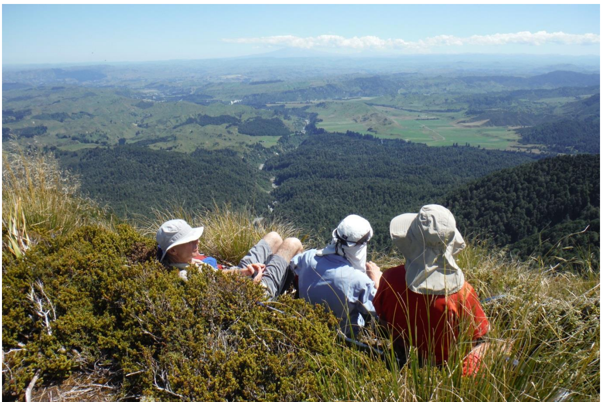
Mania Track lunch break, looking down the Pourangaki River to Ruapehu.