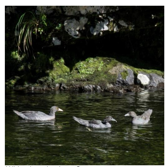
Whio

quite the right tools! We even found a useful piece of steel plate amongst the junk outside.