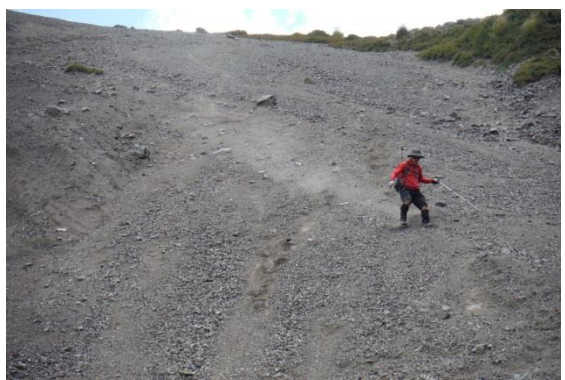
Enjoying the scree run

At the Top Maropea sign we turned off to the left and followed the ridge to the lowest part, where we dropped off to sidle across to the steep scree. I felt scared when I stepped onto the scree but I soon discovered it was quite stable and the slip was not slippery. I eventually enjoyed running down the slip following Warren. It didn't take long to get to the bottom of the slip.