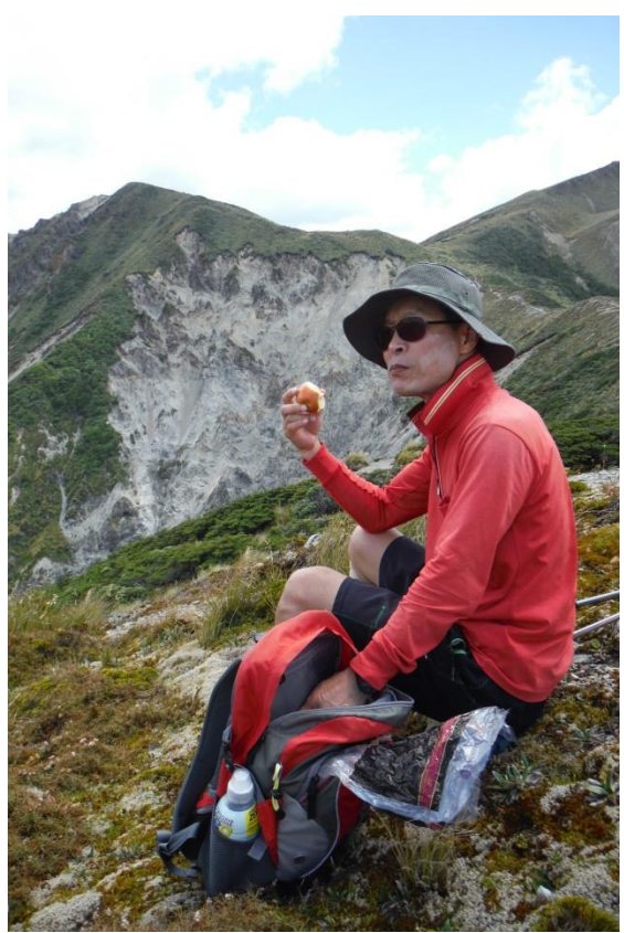
Lunch views towards Armstrong Saddle [WW]