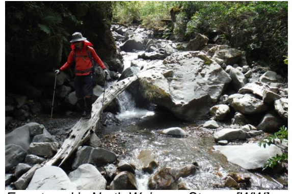
Easy travel in North Waipawa Stream [WW]

We followed the small north branch of the Waipawa Stream for about 50 minutes and then took a well deserved break at Waipawa Forks Hut before we made our way back down river to the car.