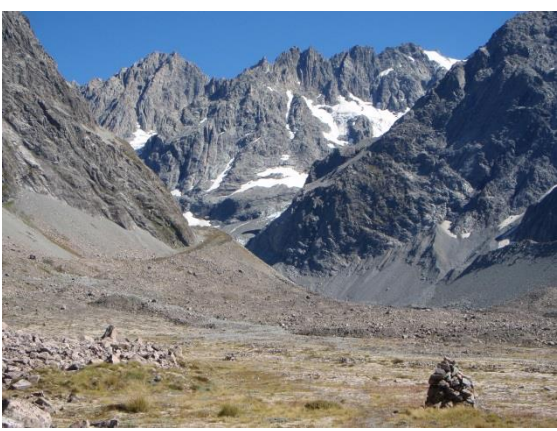
Head of Cameron valley and Arrowsmith range

The route up valley is definitely not a DoC track - it's a CMC track/route. Initially it is OK to follow but by the time you are half way the route becomes harder to follow. Plenty of matagauri and Spaniard to attack you!