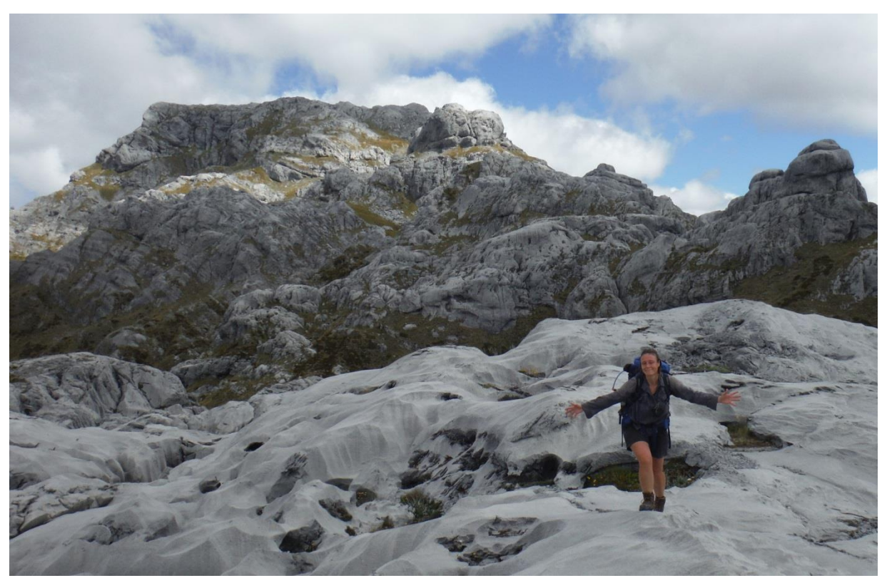
Exploring the fantastic karst landscape of Mt Owen, Kahurangi National Park