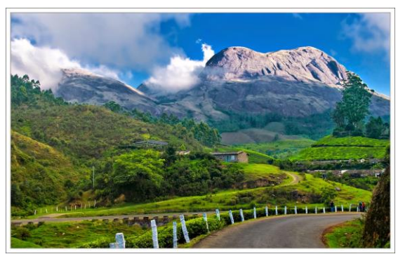
Anaimudi, highest peak in South India

The highest peak is "Anaimudi" (means Elephant's forehead) having an elevation of 2,695 metres, and also the highest point in India outside the Himalaya - Karakoram mountain range.