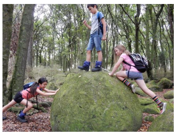
One of the many Whitecliffs Boulders.

The kids enjoyed a game of hide and seek amongst the concretions. Have fun but stay away from the cliff.