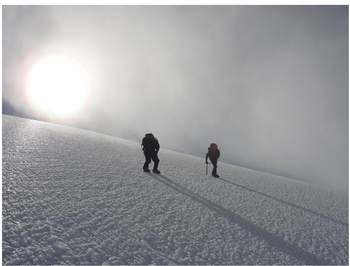
Climbers heading up Pinnacle Ridge, Mt Ruapehu