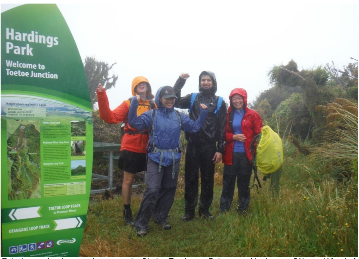
Enjoying a rainy January day out up the Sledge Track near Palmerston North