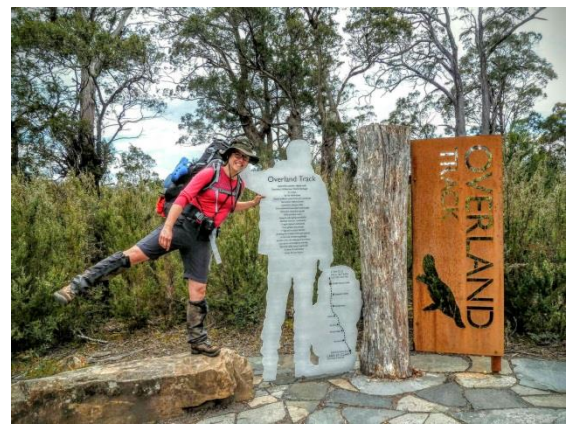
Been there, done that.

After finishing my studies in NZ I am now officially ready to work the rest of my life. In no hurry to do that I decided to visit some places on the way home. The first stop was Australia. There were a few things I wanted to do: the Overland Track and the South Coast Track in Tasmania, and snorkelling at the Great Barrier Reef.