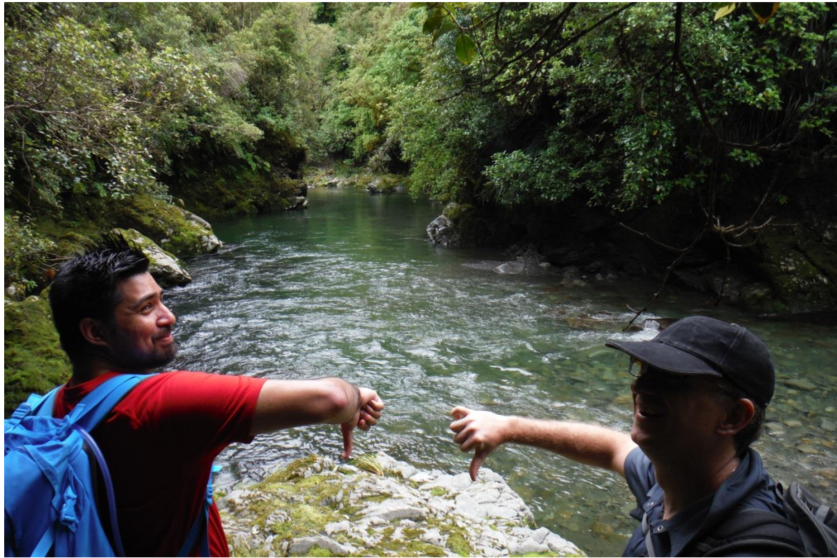
Ohau Gorge starts and stops here – too cold too high and nursing an injury. Exit Stage Left.