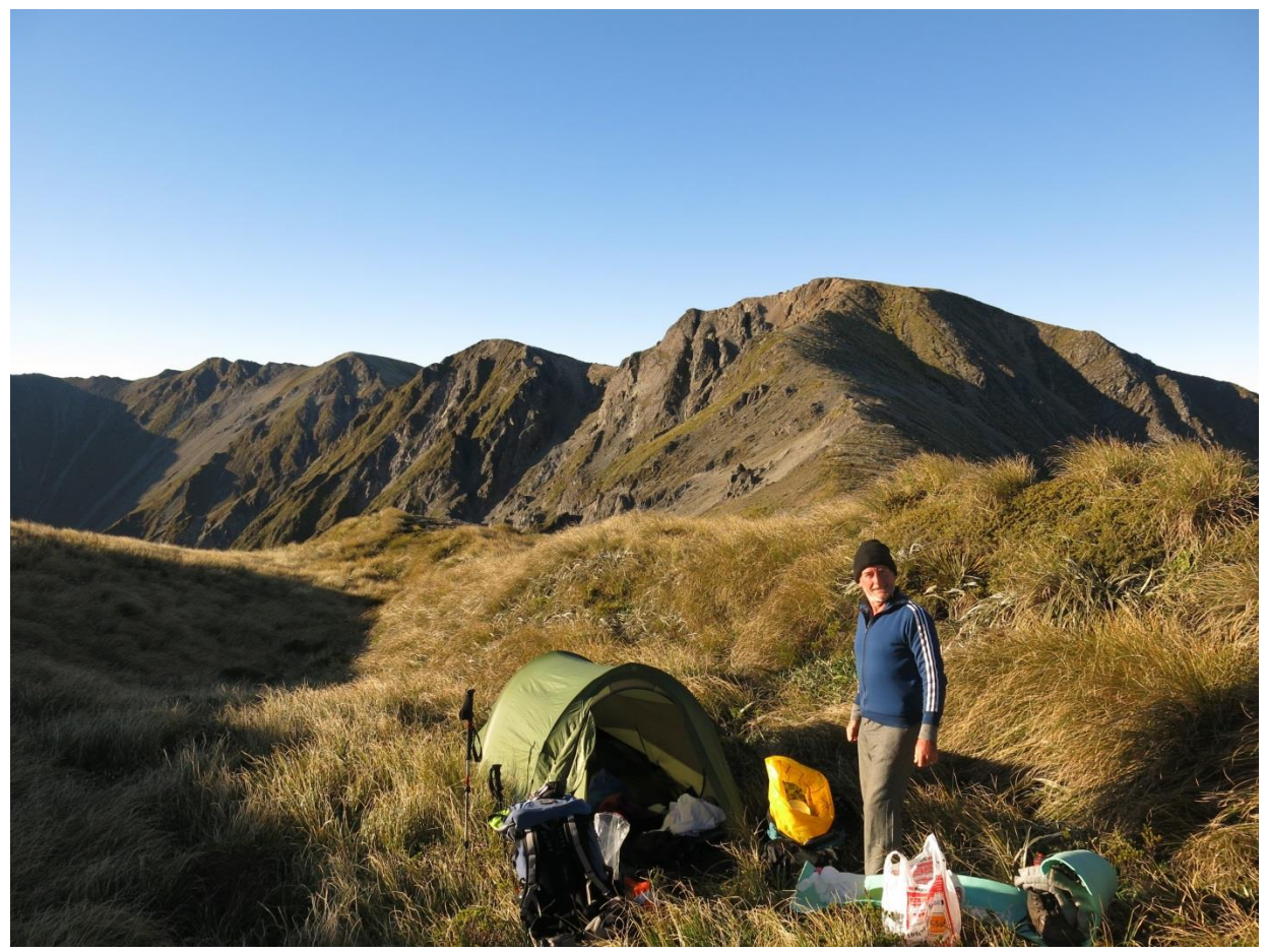
Camping on the ridge south from Three Johns with Rangioteatua a grand backdrop.

Day 6 : We knew that this would probably be the most demanding day. We crossed over Rangioteatua and ascended to the highest