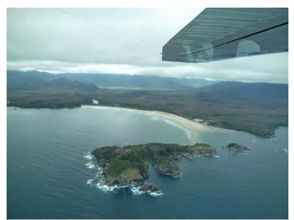
South Coast flight back to Hobart.

Climbing and descending the Ironbounds was epic, but not so challenging as the name and other worn down walkers suggested (PNTMC trained me well). At Melaleuca we spotted some of the only 70 remaining wild orange bellied parrots in the world.