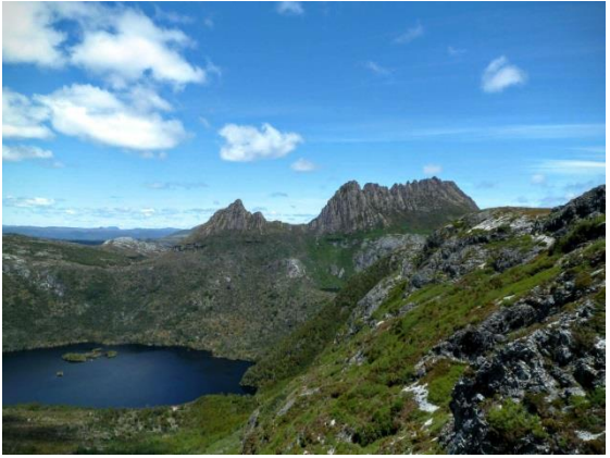
Fantastic views along the Overland Track.

The track was gorgeous. It seriously seemed that every ten minutes the scenery was totally different, like entering a new world after every bend. Lots of different plants, rocks, wallabies, rivers, birds, hills, wombats, creeks, echidnas, beautiful huts, waterfalls, skinks, campsites, grasses, snakes, lakes, trees, no trees, ups, downs, flat bits, and different seasons along the way.