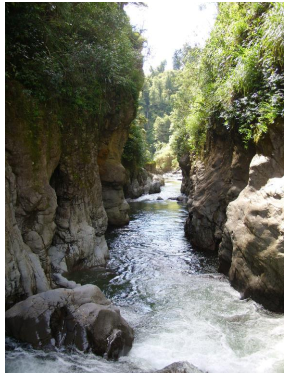
Awesome Iron Gates Gorge.