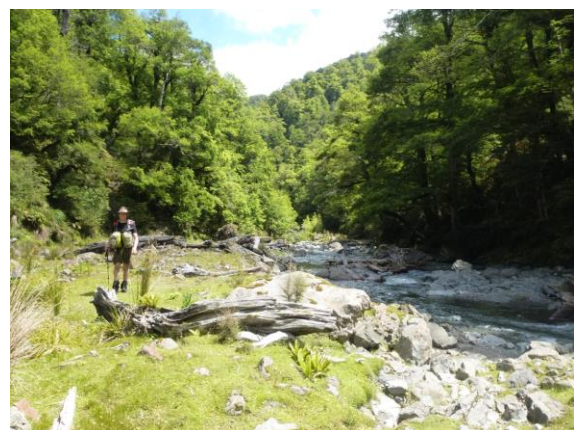
Typical easy travel in the upper Oroua.

At the saddle you meet the well-worn path again. Warren and Graeme continued north, dropping down to the river. I did a quick trip trap run to the south towards Iron Gate/Oroua River. There was a big trout to watch in the pool by the last trap. It's a steep grunt back up this track so I left the rebaiting until the uphill bit - I've heard it said that one of the good things about working with traps is being able to stop every 100m! W & G had gone off for a look downstream for ducks but had left me a radio (GR is known for being particularly well equipped) so I called them up and they abandoned their search - deep pools making for slow travel. The river from here to Triangle Hut could be described as delightful apart from one or two awkward bits. The upper section has much more gravel and is shallower than I remember. We were well over manky rotten rats by the time we reached the hut around 2.30.