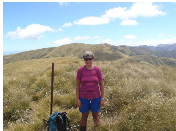
Perfect tops weather.