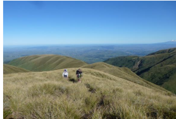
A great day to be on the tops.

ridge - it's not marked and we had our compasses out.