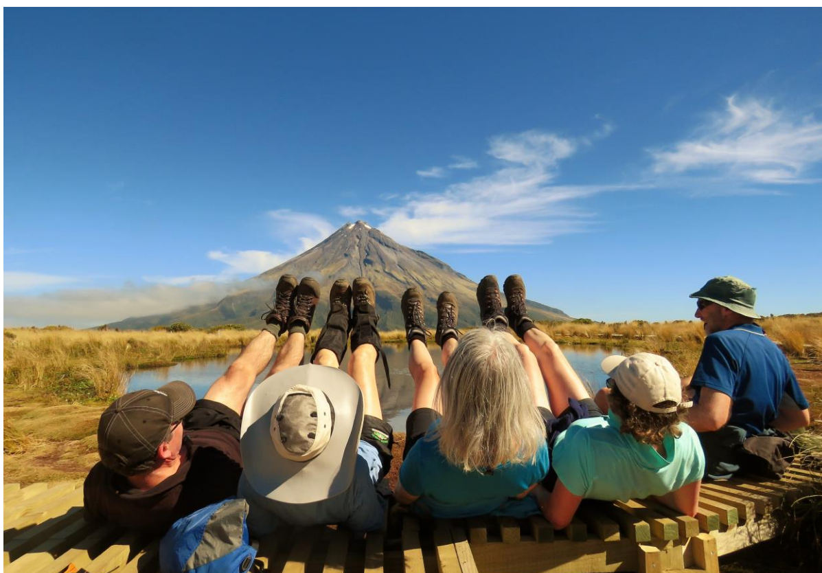
Putting our feet up with MTSC friends on the Pouakai Circuit, Egmont/Taranaki.