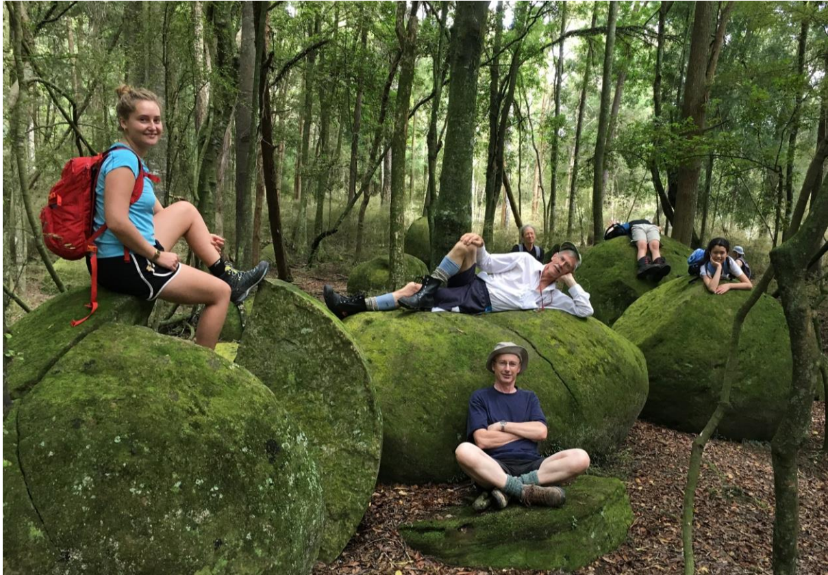
A cracking good time at the Ohingaiti White Cliffs Boulders.