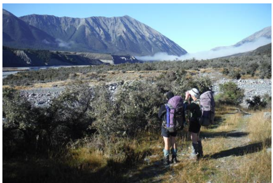
Poulter Valley 4WD track [Warren Wheeler]

Despite expectations, the scenery was very diverse. The route is very well marked and the track itself is easily recognisable probably even under unfavourable weather conditions