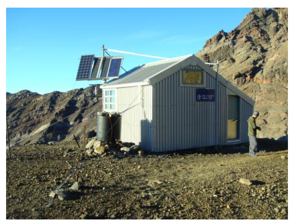
Whangaehu Hut (2,080m) before winter snow

Trip Participants: Grant Christian & Woody Lee This was planned as an easy trip so I picked up Woody at 10 a.m. for the drive to Tukino on Mt Ruapehu. The forecast was for high winds but it was calm on the drive up. The road end is at 1,695 metres and it was calm and clear on arrival but there was cloud below us. The walk to Whangaehu Hut is not far and the route is poled all the way although it is not always easy to spot the poles in cloudy weather. The route crosses a lot of loose rock, scoria and old lava fields. Woody took the opportunity to take a lot of photographs on the way but we still arrived at the hut in under two hours. The hut is at an altitude of 2,080 metres. It is a well-insulated double-glazed hut with four double bunks owned by NZ Alpine Club.