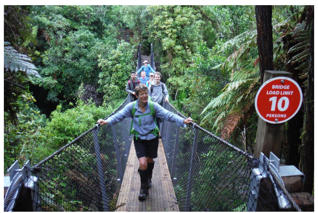
Trying out new bridge over Kahuterawa Stream, links Sledge Track to Arapuke