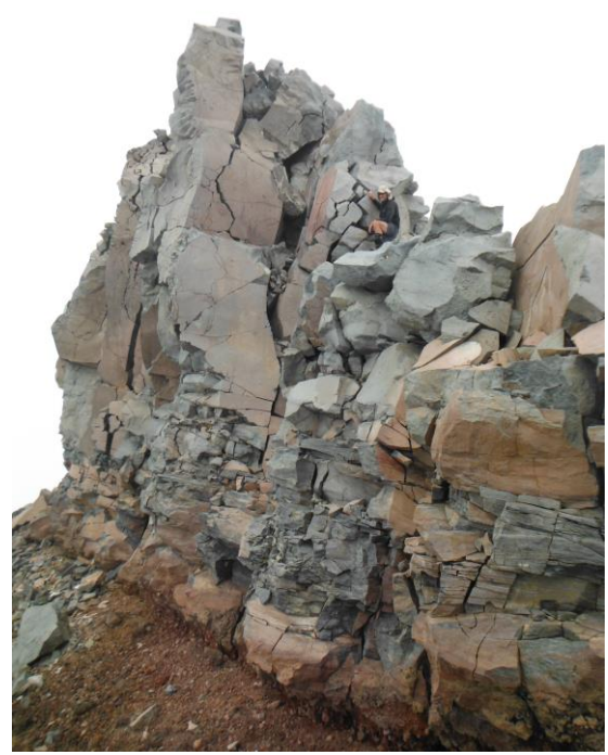
Getting steep on the gendarme [Woody Lee]

We unpacked our overnight and cooking gear and had a cuppa. We then decided to go for a walk up the ridge north of the hut. The ridge climbs quite steeply and further up there is a very prominent gendarme that I have often looked at but never investigated up close. Where we climbed the ridge was mostly large but loose rock. We sidled around the top of the ridge where it got very steep and after a little over an hour we reached the gendarme. At this stage the cloud had closed in around us. I managed to climb half way up the gendarme before it got very steep. Woody preferred to wait at the bottom and take photos.