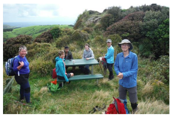
Lunch at Platinum Mines lookout

Seven of us enjoyed lovely weather and a somewhat muddy uphill track to explore the old mine shafts and enjoy the birdsong on the Toe Toe Loop in Hardings Park. Nice to have such a day out so close to Palmy.