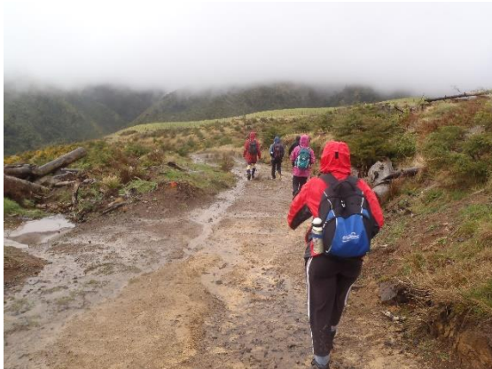
Gloves were donned then the cloud lifted.

Gloves were donned, and 7 soggy trampers set off and startled a kereru out of a tree, then soon left the Back Track behind, arriving at the large MTB carpark. From here it was exposed and colder, definitely beanie time. We followed Arapuke Road, gradually uphill, gazing at the piles of logs everywhere, and the profusion of MTB trails, all named. I guess that this area has been logged in the last year or so, and that previously it would have been a very sheltered walk among large pine trees. Every intersection was signposted, it would be hard to get lost! Looking North to Palmy, it looked quite bright and fine down there.