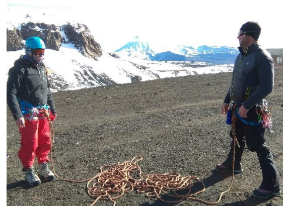
Just pretend it's glacier, OK?