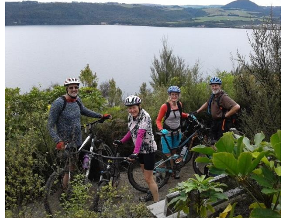
Enjoying the views over Lake Taupo.

Sunday: A much friendlier wx forecast. With a little fear and trepidation, we set off for what was going to be the big day. I'd seriously considered going shopping instead, not wanting to hold the others up or anything! Miraculously our bikes had loaded themselves neatly into the back of Richards ute, thanks fairies.