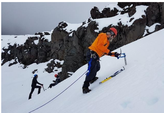
Secure with a snow stake.