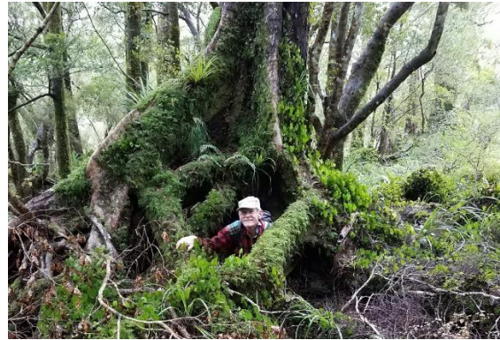
"Hobbit" in the tree roots

bunk beds and mattresses. There are also 2 outside toilets (very important!).