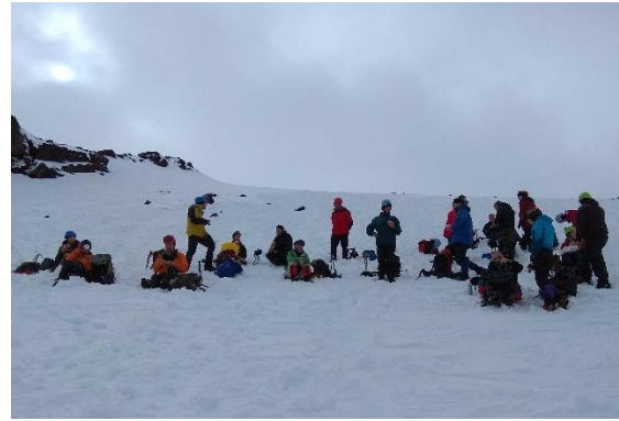
Morning tea break.

A session on sampling snow and ice for avalanche risk gave us all a bit of a rest late in the afternoon as did a quick look at how to find someone who may have been buried after an event. Once the learning was over we all went for a bit of a walk that involved looking desperately for a challenge. I guess the fact that we didn't find much of one meant that those of us who were booked for the next session were ready.