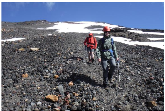
A good scree run to finish.