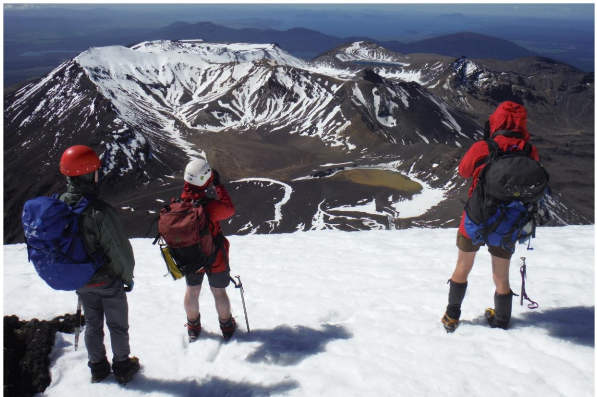
Looking north over Tongariro to Taupo.