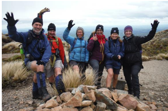
Hello Armstrong Saddle

Most of us had a look at the track leading up to the pass, and a few of the fitter members decided to progress on up the track along the ridge to explore the Armstrong Saddle. The wind was not up to its fabled levels and the group seemed to make good progress as they vanished up the track.