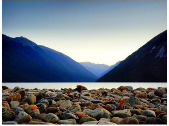
Elly Arnst - Sunset on Rotoiti