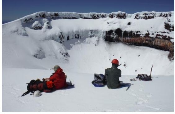
Lunch stop on crater rim out of the breeze.