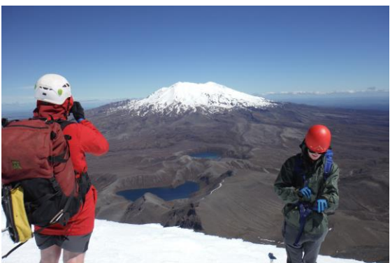
Ruapehu without plume of erupting ash.