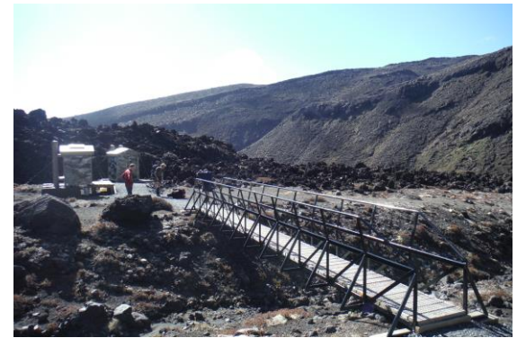
Pooh Sticks anyone?