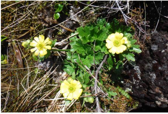
First buttercups at Soda Springs.