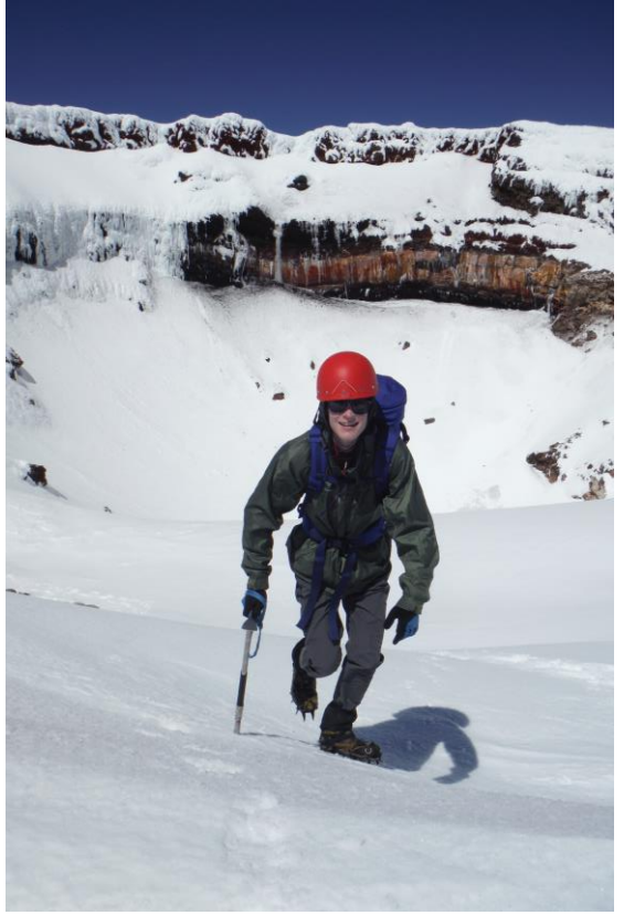
Looking good, feeling good.