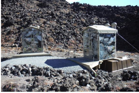
New camo-loos, but no hiding the smelly poos.