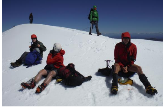
Roped up Russians vs crazy Kiwis in shorts.