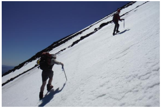
Easy zig zag slope for the crampons at last.