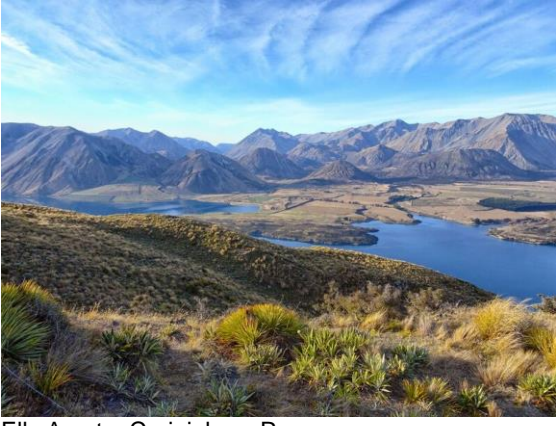
Elly Arnst – Craigieburn Range