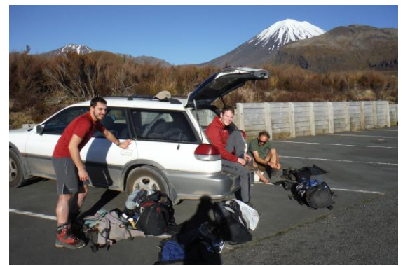
Car park all but empty of very happy trampers.