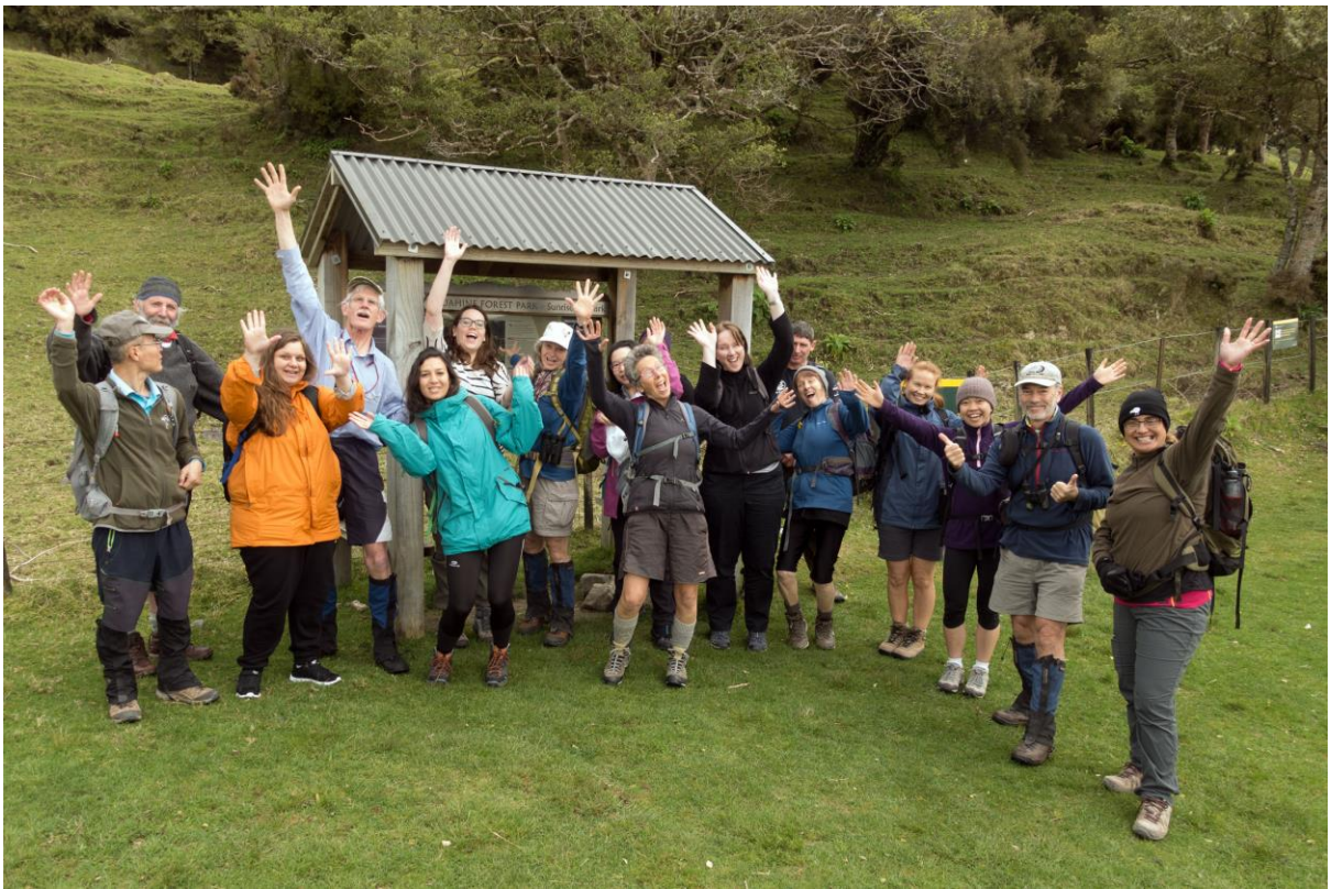
Intro Tramping 2 farewell civilisation at Sunrise Carpark, Ruahine Forest Park. [N