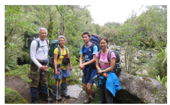
Jackets off, ready to start climbing.

'floors' we had climbed! Thanks for the company, another great weekend out in the hills.