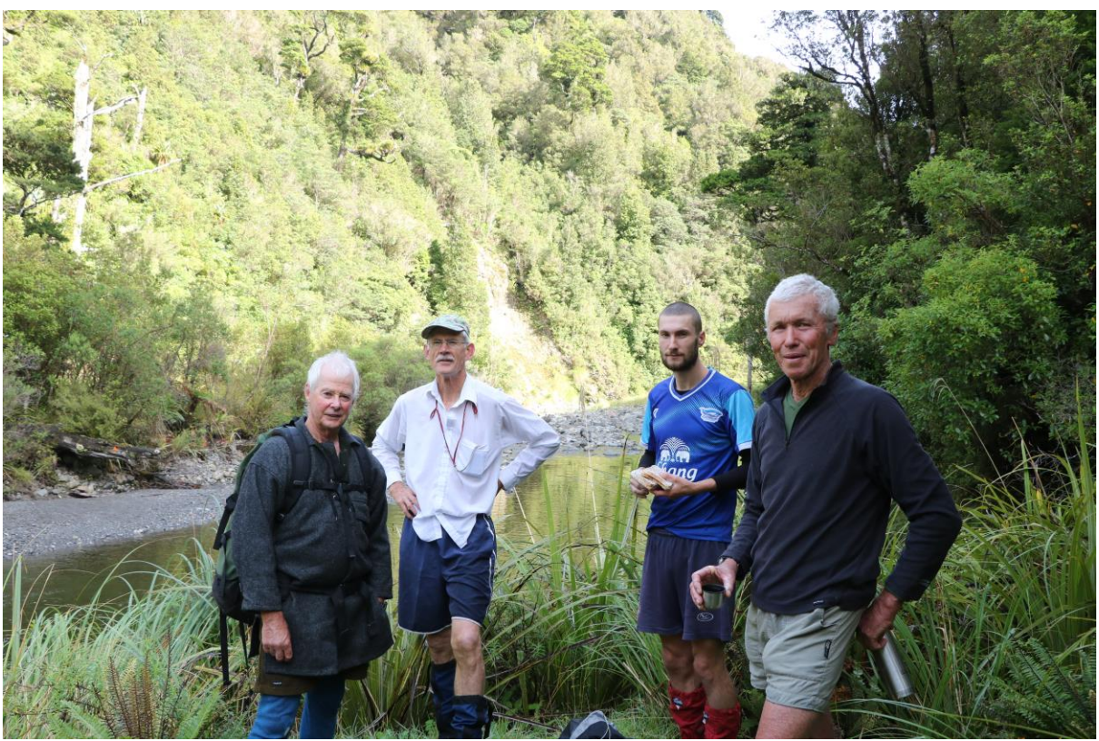
Happy to be back at Baber Creek after some leatherwood bashing along the tops, northern Tararuas. [Naser Ghardash Fard]