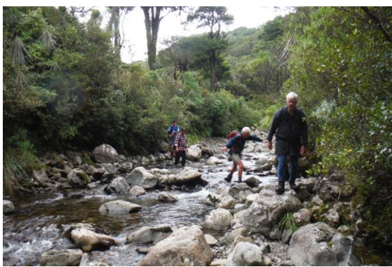
Pleasant travel down College Creek

Burn Hut was sighted in the near distance but as we turned left there would be no points earned or huts bagged today. After a bit of uphill we descended a pleasant track to College Creek which was the "track" back down. Numerous crossings ensued as we scrambled our way downstream over slippery rocks with two falls at least noted. Thigh deep passage was about the furtherest my legs went to the creek bed. A short creek side sidle was a pleasant change but short lived and the orange markers in the creek bed assured us that we were on track.