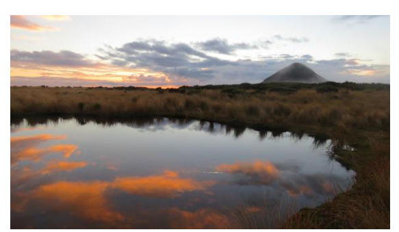
Dawn reflections in Pouakai tarn.