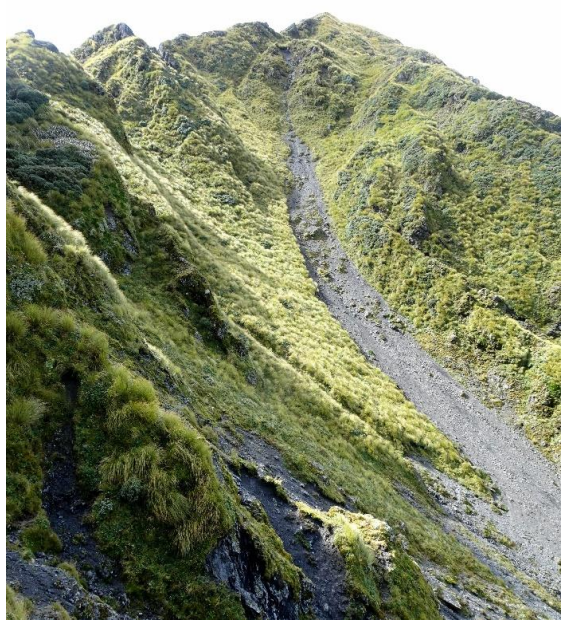
Angle Knob – we descended most of the way down the scree, then cut a line West to re-join the ridge.

Soon we regained Angle Knob and turned SW following a light footpad which led us to the top of a slip on the southern side. Taking a look, we decided we could get a good way down the scree, before cutting a line to the right which would place us in the saddle just east of pt1412. It worked a treat. The descent was relatively easy and meant we avoided much of the exposed scrambling and ups and downs of the main spur.