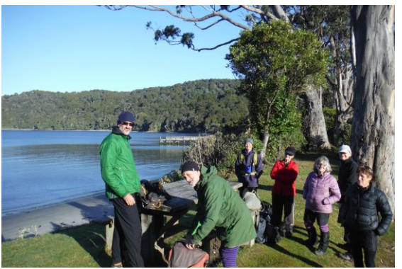
Nice day at Port William