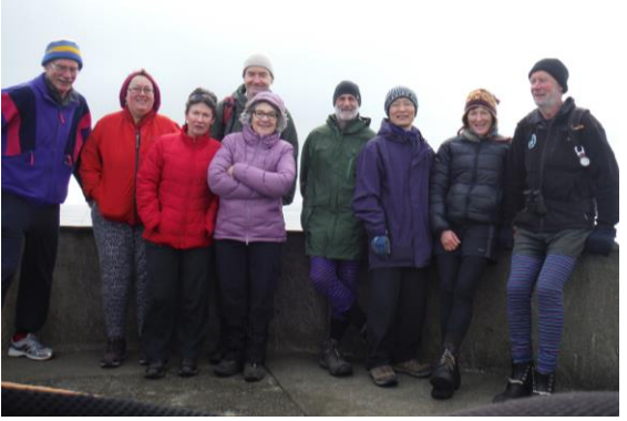
Group selfie up on Bluff Hill