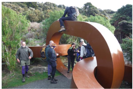
Anchor chain at Lee Bay end of Rakiura Track