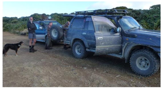
4WD gives easy access up Takapari Rd.

The drive up was fun - the road in quite good condition. The cedar trees and giant cabbage trees up high are always a lovely sight to see.