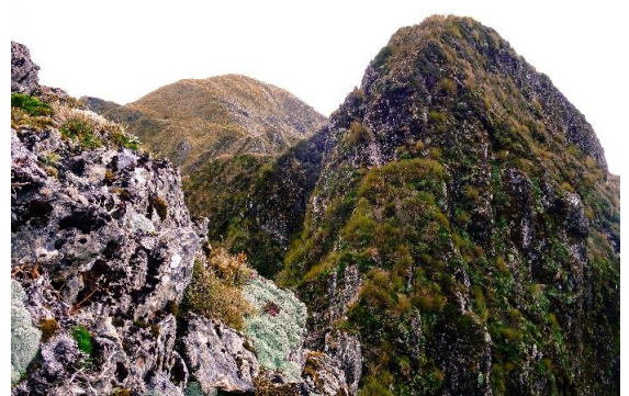
When you ignore sidle tracks you get to descend sections like this!

The rest of the walk along the tops is an easy doddle. The distant clouds lift; we can see the northern summits - the Kings, Adkin, Girdlestone and Dorset Ridge. In the true spirit of high point bagging, we make a quick detour up South King. Middle King is tempting, but we still have a few hours of walking ahead of us yet. By the time we reach the flat, indistinct highpoint of Baldy, the weather has closed in again, the southerly resumed. Spying orange triangles, we embark on the Baldy Track, making good time down to the junction. Turning south, we walk and walk until we are finally forced to switch our head torches. Atiwhakatu Hut sits dark and quiet.