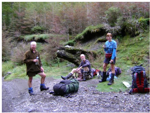
Rest stop in Upper Makaroro.

The travel to Upper Makaroro was straight forward albeit quite cold for the feet. We were the sole occupants of the hut and we soon had the fire going making life quite cosy. There had been some discussion about some forecast rain overnight and being stuck on the wrong side of the river. If it was essential we could have carried on back to Parks Peak, however common-sense prevailed and we stayed put.