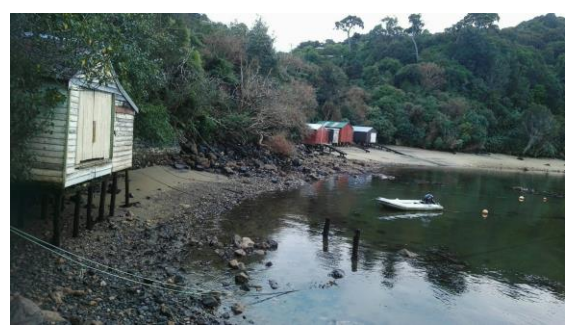
Golden Bay at low tide

dolphins swimming around our boat. The ferry master said this happened quite often with different pods. The older bulls of the pod swam around the front of the boat criss-crossing underneath the prow and surfacing intermittently. They appeared to be playing and we certainly appreciated their antics!