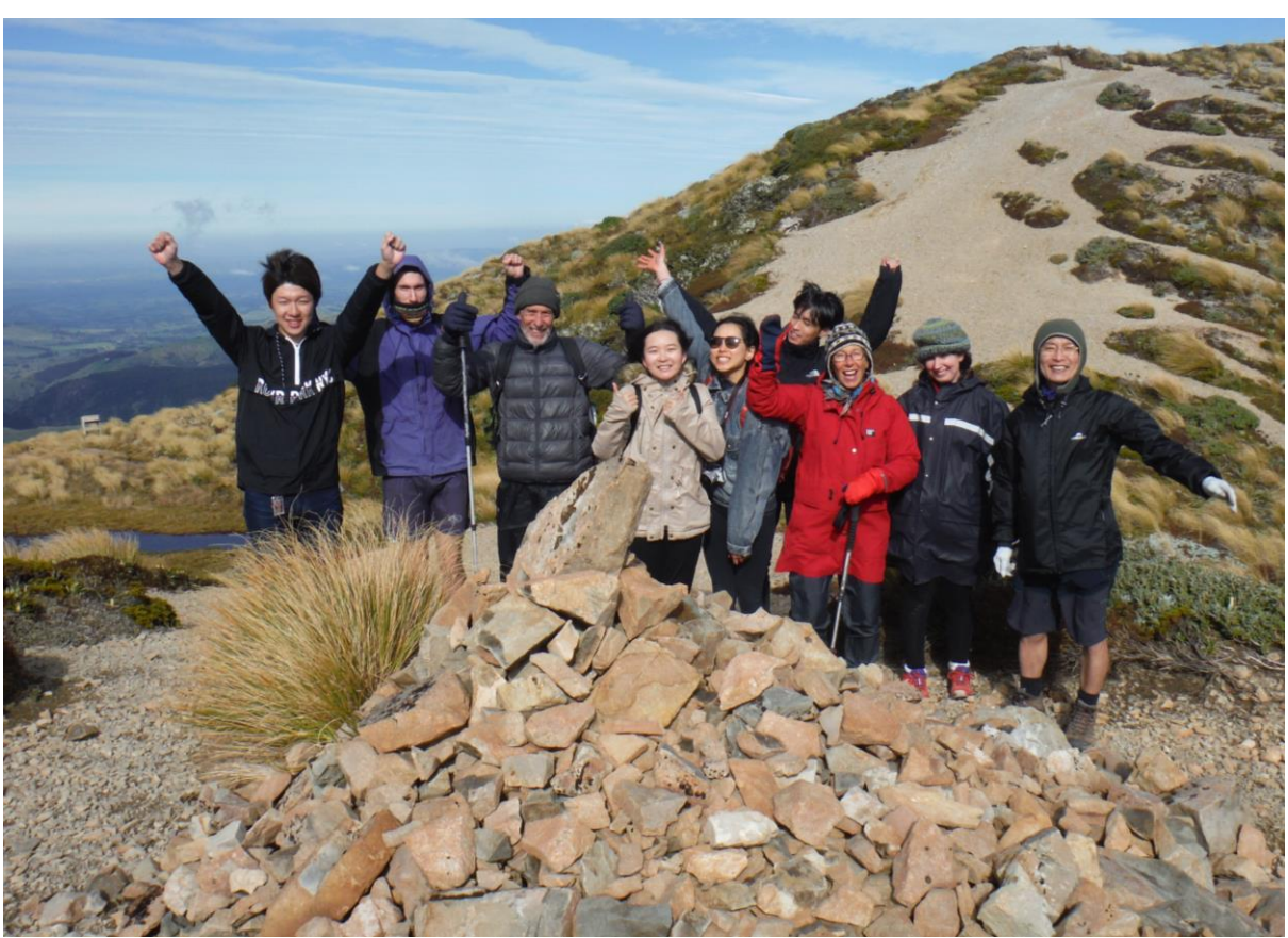
Hi from windy Armstrong Saddle, above Sunrise Hut, Ruahine Forest Park.