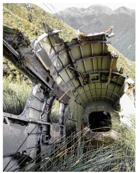
Shingle Slip Plane Wreck

Waist high tussock wading (my favourite) proceeded until we began to ascend Shingle Slip Knob. Checking his GPS, Chris located the general direction of the wreck and we began searching. It's not visible from the top, but soon we were on the edge of a steepish bit, twisted metal glinting directly below on the southern slope. Picking our way down, we careful investigated — spending some time poking around and taking photos, all the while wary of the sharp exposed metal edges.