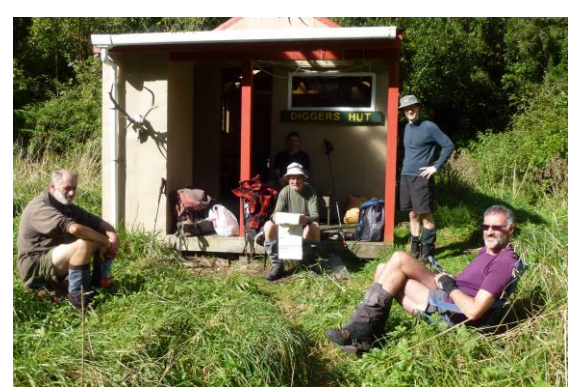
Enjoying the peace at Diggers Hut.

The river showed signs of recent high flooding - near to the hut the river bank was piled with driftwood. It was about a 2 hour tramp and we enjoyed lunch at the hut before retracing our steps - a little slower on the uphill return journey. An enjoyable social walk.