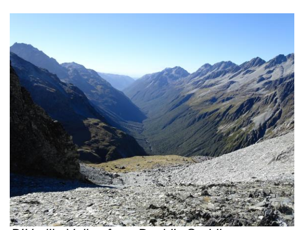
D'Urville Valley from David's Saddle

Worst High Point: Mayo Knob - an indistinctive blimp in the forest with no view. Unsure why it was deemed name-worthy.