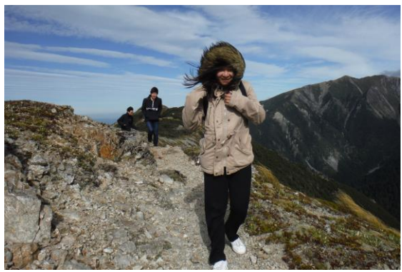
Braving the wind along to Armstrong Saddle.

There was much discussion on the way back down to the car, with different people pairing up and chatting about China and many other topics.