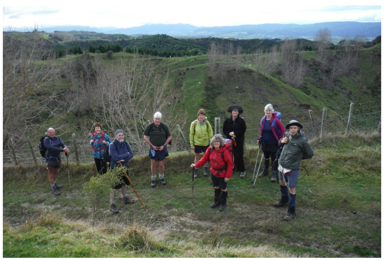
Ready to leave the top of Branch Road Walkway for the return to Pohangina.