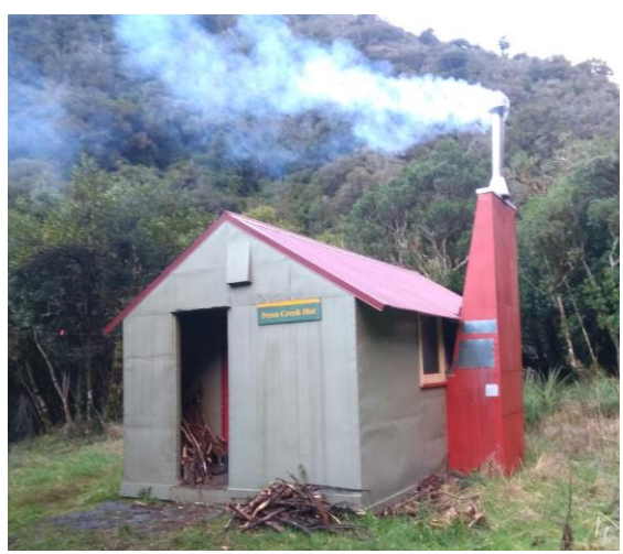
Hurray, we have got the fire going!

As our lunch break would have to be at Table Top (by definition), we only took a short break at Field Hut, found our way to the summit and descended a bit to a wind sheltered place for lunch. After a steep descent to cosy Penn Creek Hut, we were not done yet with our exercise for the day but chopped wood to add to the stock at the hut. When we finally had got the fire going, we enjoyed our dinner and had a good sleep in a nice, warm hut.