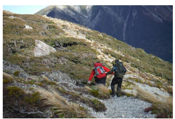
Bracing against the severe gusts.

Once we left the shelter of the leatherwood we got hit for six by the gale force winds, around 100km per hour, blowing across Armstrong Saddle.