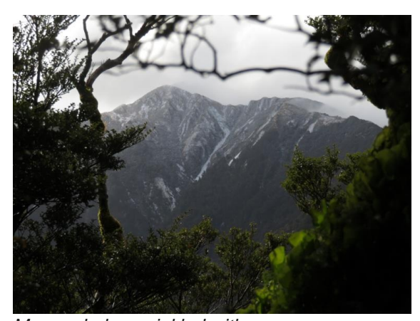
Maungahuka sprinkled with snow.

The snowy twin peaks and Mangahuka were seen briefly, and late afternoon rays caught the beech mast on Concertina Spur, turning it a rich golden orange.