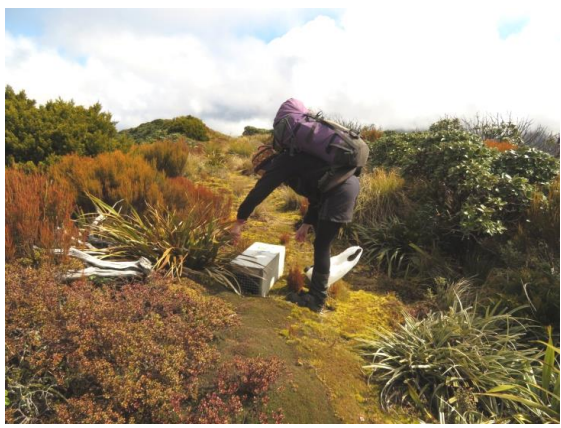
Stoat carcasses cleared with delight.

rippling overgrown grasses, intermittently shining in the sun.