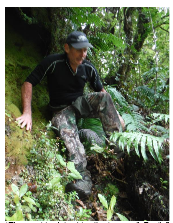
"The worst bush bashing I've been on". Really?

slide our way back along our tracks to emerge once more in the dry gully – the stony ground is so porous that any snow melt was soaking underground. The gully is not a place to loiter, with visibly fresh rock fall from the steep unstable sides above and the flattened vegetation and patches of snow indicative of avalanche activity.