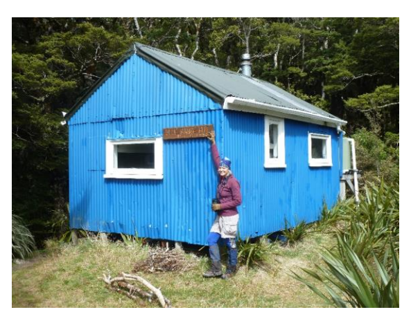
Here it is - Blue Range Hut