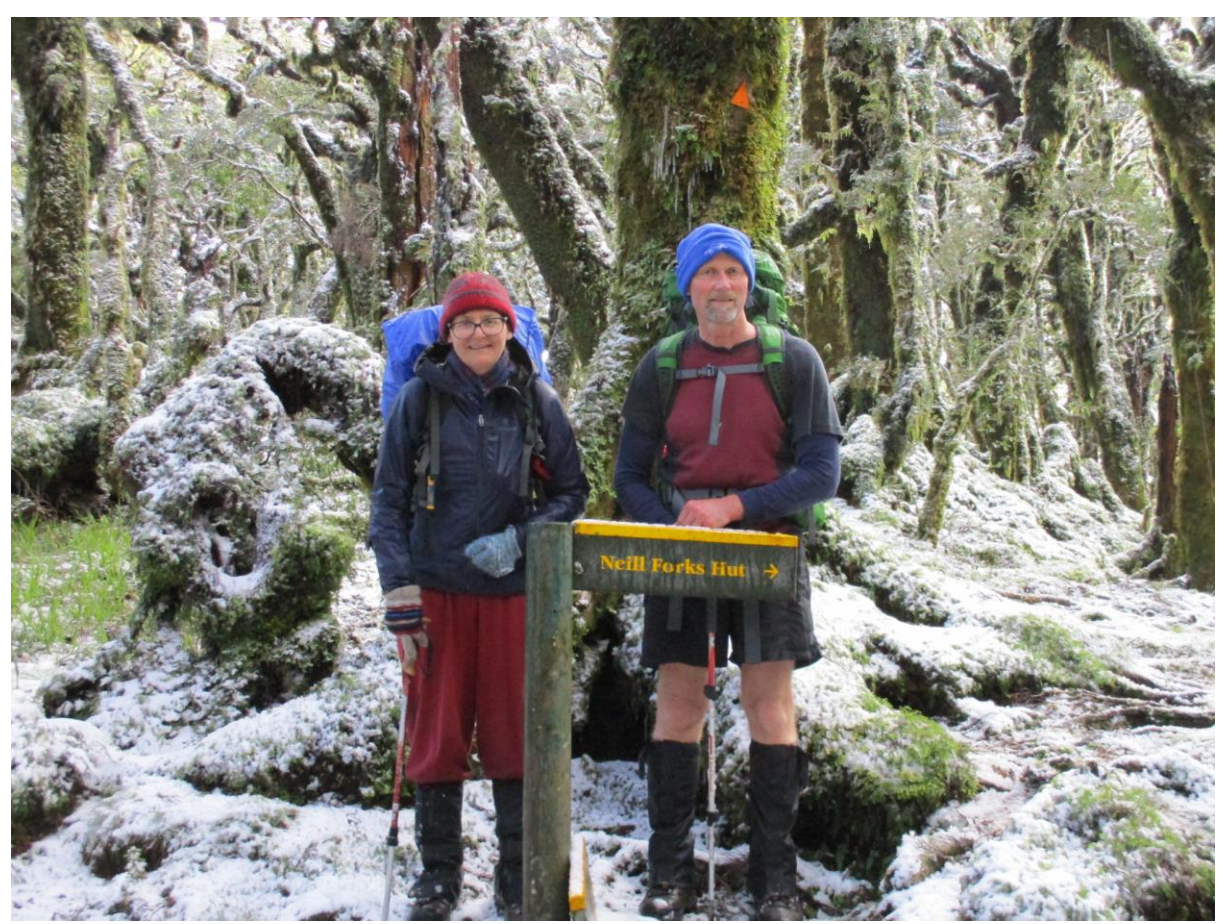
Enjoying a snowy trip into Neill Forks, Tararua Forest Park.