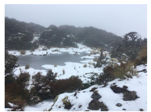
Wiggling tarns on Cone.

whipping across the snow and the picturesque wiggly tarns. After checking the map to make sure we could claim points for Cone, it was a slow trip picking with care off the top. Lunch was had on the hoof in the middle of an anonymous howling slope somewhere.