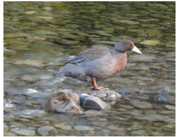
Click - HURRAH - time for another coffee.

After long lingering, bodies started emerging from the hut. It was time to pack up. Suddenly a whio was heard downstream. Dashing to the river bank with the camera, the rocks were searched, and there they WERE!! The shutter was clicked – HURRAH!! A second coffee was needed after all of that, supplied by the kindness of others.