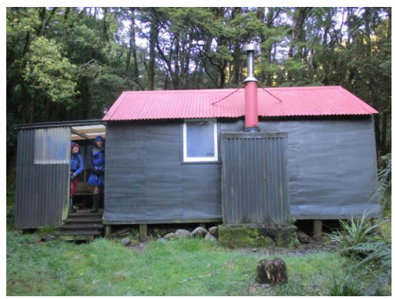
Neill Forks Hut.

book – an excellent division of labour, really. Stars had come out by the time we sat round talking in the candle light, sipping Woody's pinot noir