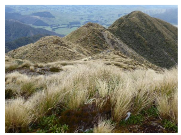
Looking back at Herepai from the lunch spot [Kirsten Olsen]

We were surprised that we were just as slow going down as we had been going up.