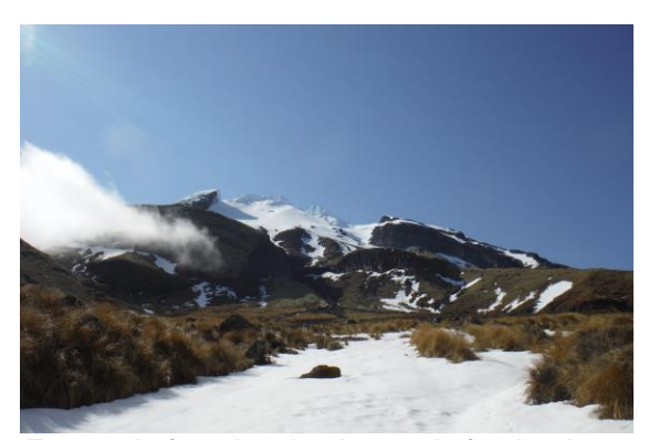
Egmont before the cloud came in for the day.

Pyramid Stream gully, where deep erosion made it impossible to cross. Impressive, but the view was rapidly disappearing as cloud came in and thoughts turned to finding my way back (or not) to Mark in a whiteout.