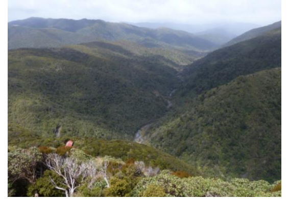
Herepai Hut seen from above

hole! It was not difficult but it slowed us down. We reached the peak of Herepai at 1pm.