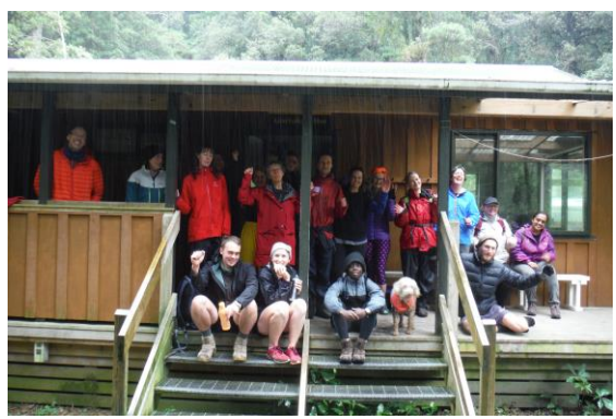
Lunch time at Atiwhakatu Hut.

For myself, the track was friendly enough to continue on with some of the conversations that had started on the drive down. We appreciated the appearance of native trees covered in raindrops and I tried on some natural lemonwood (tarata) perfume. I ate the corner of a horopito leaf (very peppery) and even overheard another brave individual downing what sounded like 10 of them at once!