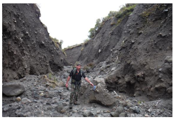
Blue marker on rock - no worries then.

the track had been freshly cut to 2m wide. This was much easier travel than the "maintenance overdue" condition of the ATM track so in short time we reached a deep washed out gully, which appeared to be where the old track disappeared. Here the cut track detoured about 100m downstream to where a route had been found to get down and back out the other side.