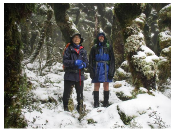
Snowy goblin forest.

Alas, the beautiful start to the day didn't hold, and by the top junction it was snowing prettily. Craig led the way as we then slushed and slithered onwards through the goblin forest in deeper snow, with the wind rising, and passing hail showers clattering companionably against the parkas. Snow sat on the mossy tops of all the wiggly branches, while icicles hung beneath.