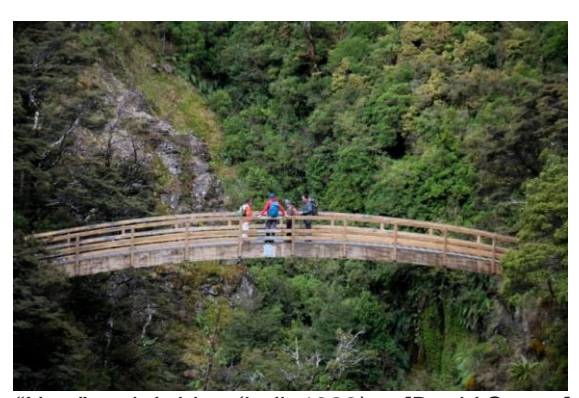
"New" arch bridge (built 1988). [David Soong]

It was a little overcast to get the best view, but certainly a vista spread out below us. After utilising the artfully decorated toilets and time for morning tea, we carried on up through the tussock some way further. It was quite wet underfoot, but not as hard going as I remembered from the past, when we were in knee deep snow at times.