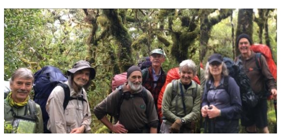
Successfully meeting the main track again.

A couple of little lookout spots added interest, one with a few rocks surrounded by colourful Dracophyllum filifolium proving a nice place for a spot of afternoon tea, though our view was mizzled out with curly mist sucking around the tops.