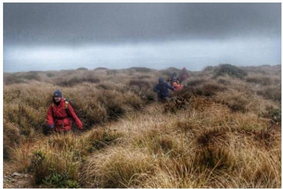
Overcast up into tussock.

welcome lunch, and eventually we were all fed and ready to make our way back.