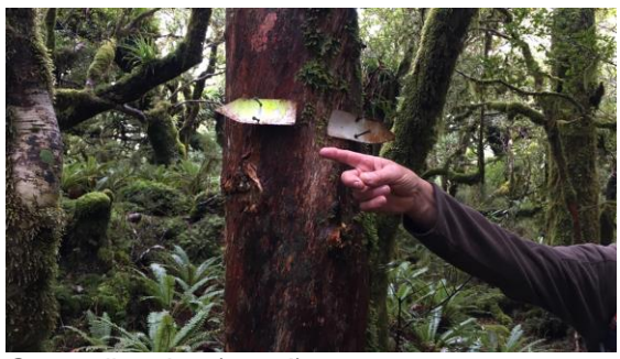
Some direction (gasp!)

Rising to leave at 1-o-clock, we branched off the track to pad randomly uphill initially between thin tall trees. We then threaded along the ridge that runs east above Sayer Hut, partly along animal tracks, partly following pieces of cream foil, wrapped with unnerving inconsistency around the odd branch here and there. We crept along over large mossy logs, through goblin forest dripping with epiphytes and between moist tightly knit shrubs, all to the sweet sound of tomtits and grey warblers, and the less sweet sound of rustling of maps and compasses.