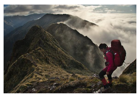
Descending Tuiti, only 5 hours to Kime