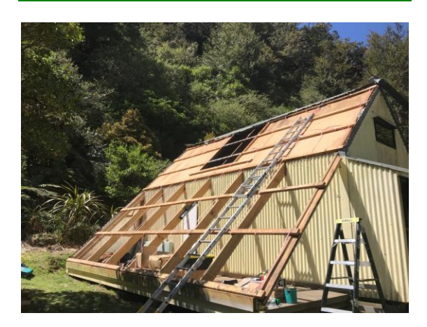
DOC News - Daphne Hut Upgrade

Renovation of Daphne Hut was completed at the end of October with new roof, flooring and deck, thanks to Army Engineers working alongside DOC.