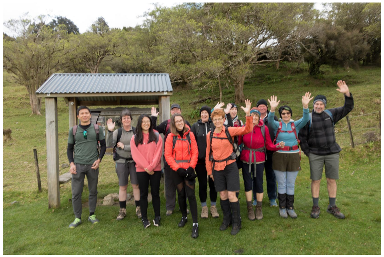
Beginners Tramp to Sunrise Hut, Ruahine Forest Park.