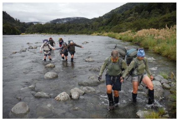
Crossing Waiohine River

Eventually the others clattered across the boulders and we got going, linking together in the prescribed way to wade with wonderful security across the widest part of the river which was still thigh-high for the vertically-challenged. The lovely Totara Flats were glowing in a rare splash of sunshine as we swished through the grass heads along to Totara Flats Hut, with yellow-hammers zip-zip-zeee-ing from the kanuka by the river and tui bing-bonging from the bush to the left. At the hut people spread out and lounged around the long sunny veranda.