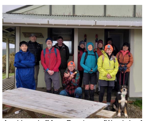
A cold send off from Rangi.