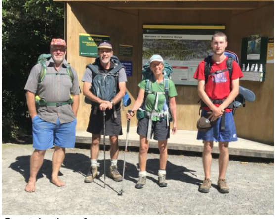
Spot the barefoot tramper.

Then we sidled up and down besides the river through beautiful bush and some massive rimu and kahikatea.