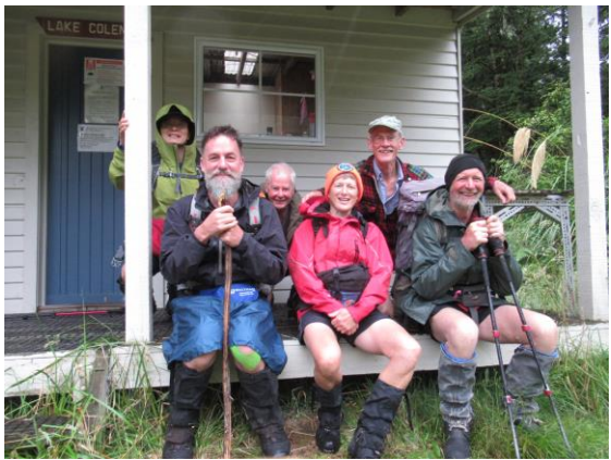
Stoat-slayers at Colenso Hut