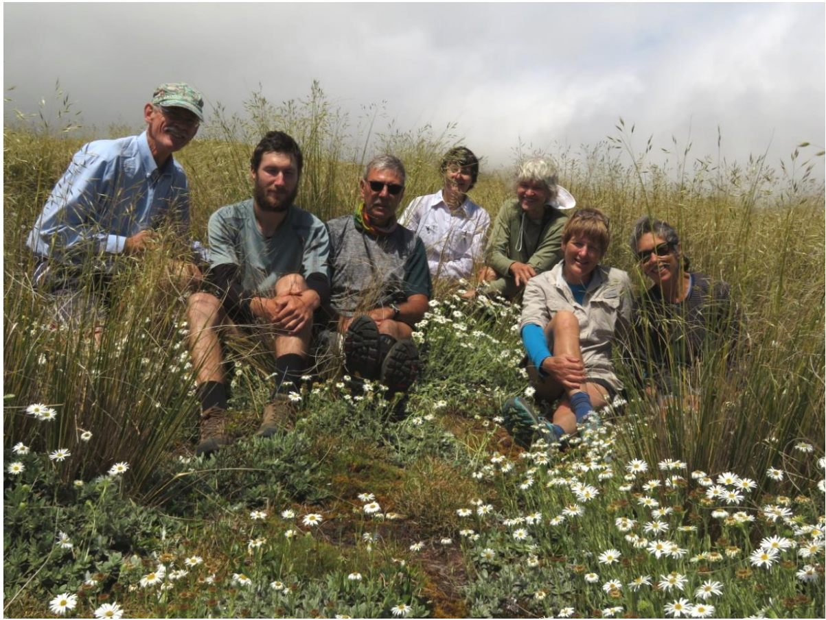
Enjoying the alpine flora above Rangiwahia Hut, Ruahine Forest Park.