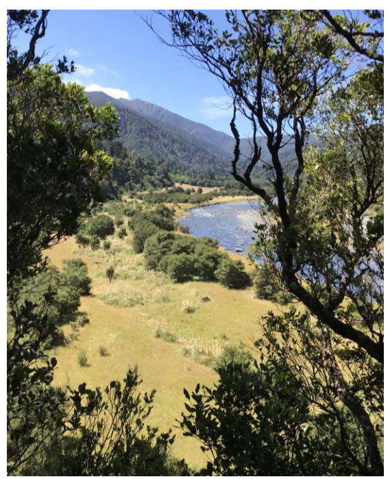
A beautiful day at Totara Flats.

The side streams are all bridged and we spied some good swimming holes but we didn't feel suitably hot and sweaty to need a cold dip. The last 2 hours of the walk were my favourite, right by the river, fantastic views of the river, and 2 kms of grassy flats reminiscent of African grasslands (although we didn't see any lions or giraffes.)