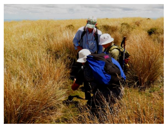
Field studies in the tossing tussock.

At any subsequent area of notably flattened vegetation, a comment would drift out that "X has been here". Warren displayed botanical flair, discovering a patch of unexpected mid-tussock odd-leafed orchids, a patch of rarely seen purple Myrsine berries and then a commonly overlooked mountain geranium (although this flair did not extend to finding his lunch in the freezer, he arrived with plain sliced bread instead of sandwiches - Ed).