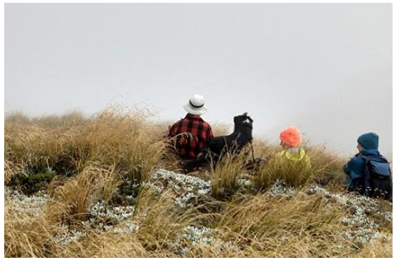
Non views from Tunupo.

After lunch we carried on up for the short stretch to the top where the others were still lazing around.