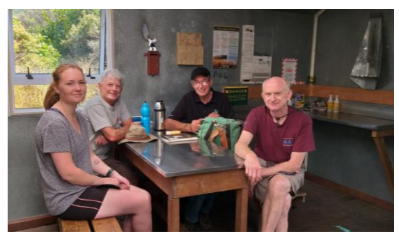
Lunch at Herepai Hut

While on our walk to the track junction we met few groups who were on their way back to the carpark after staying the night at the Herepai Hut. They all said the 10-bunk hut was full and some trampers had to leave for Roaring Stag Hut for a comfortable stay.