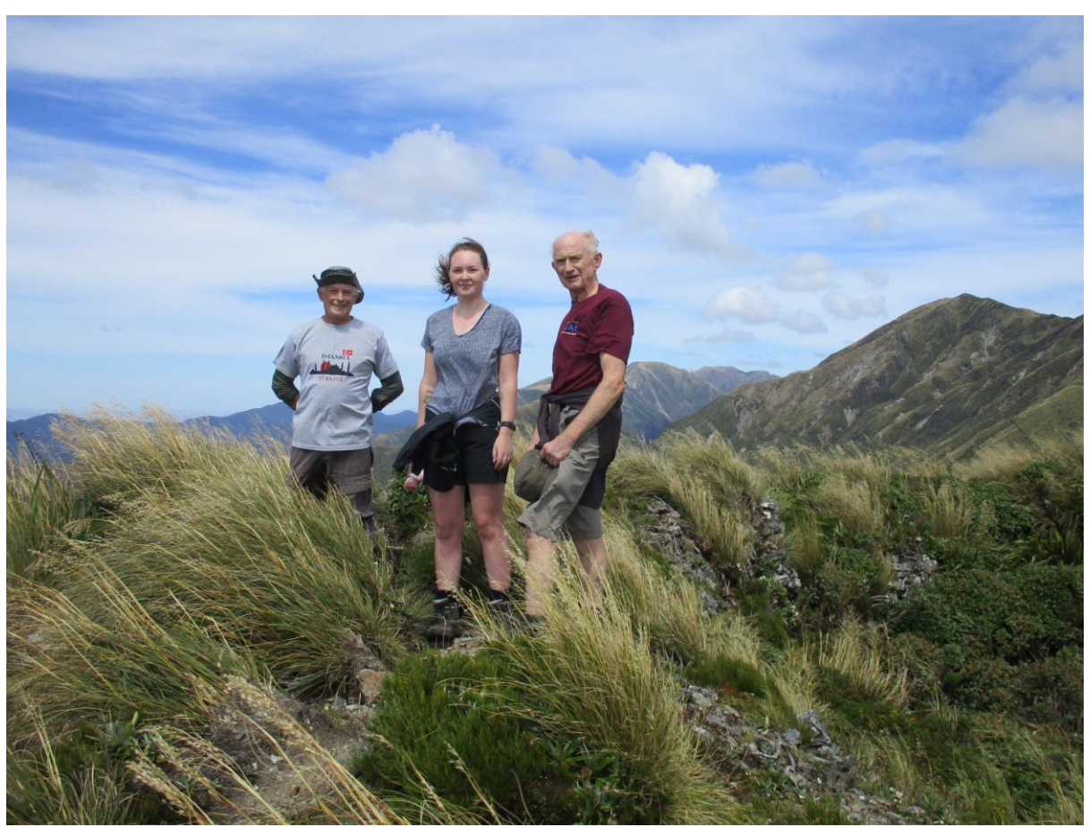
High in the summer breeze on Herepai, Tararua Forest Park.