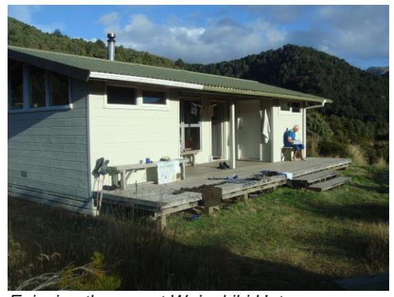
Enjoying the sun at Waipakihi Hut.

After a couple of hours we could see the Umukarikari Range which extends to the river, opposite where the hut is situated. It was still a good distance off as we took a welcome break in the shade by the river. Three people approached from upriver. They were hunters that were camping down river and had gone out for a midday walk without their rifles. After another hour or so we caught site of the hut sitting on a small terrace well above the river, not too far ahead.