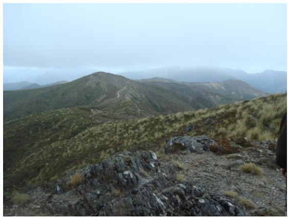
Easy tops from Urchin trig

We left the road end before Bruce and Penny and climbed steadily up to the bush line. Soon after we reached Urchin Trig and had views of the ranges beyond. The weather was warm and calm as we continued along the easy tops. After a couple of hours we reached the turn off to the Waipakihi River and descended a spur which gave good travel until we reached the bottom.