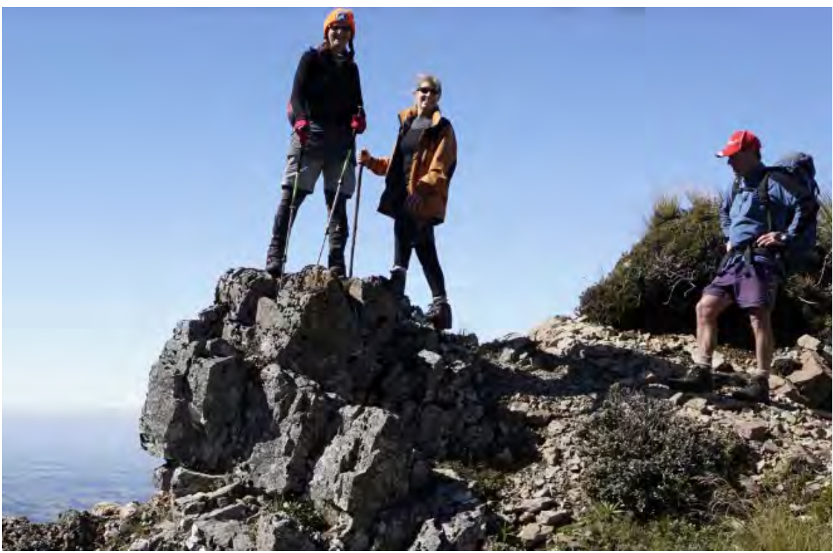
This photo is on our Tramping for Beginners Poster. Details of the Tramping for Beginners series along with many other trips are detailed in the upcoming PNTMC Trip Card for July to December 2019.