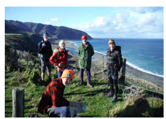
Looking east from Baring Head

Next morning dawned fine and warmish again (a brisk Northerly blowing) - the six of us decided to make the most of the day and headed up and over the hills to Baring Head lighthouse (Bruce -" they left me behind again!) This is again a well signposted farmland walk that starts a short drive from our accommodation.