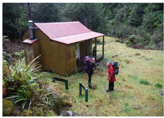
Leaving Iron Gates hut

Light dristy mizzle seemed to be hanging around more than forecast and made for a good test of raingear languishing after our long dry summer - mine sorely in need of waterproofing it seems. It was nice to warm up in the hut thanks to the wood-burner stove and a ready supply of dry wood thanks to DOC recently clearing trees from behind the hut. They had done this in preparation for the new hut build but this has now been postponed until after winter. The same team of tree fellas have also done a great job of clearing the track all the way out.