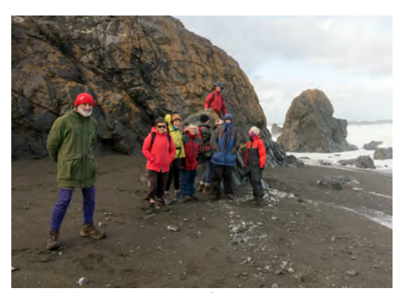
Well wrapped up to face the southerly

The roast dinner went in early which turned out to be fortuitous - the southerly storm strengthened as night fell - and the power went off. There were no candles so a candlelit dinner was off and as only some of the vegetables were cooked, we feasted on baked potatoes and roast meat sandwiches. The power did come back on in time for dessert but then went again so everyone had an early night.