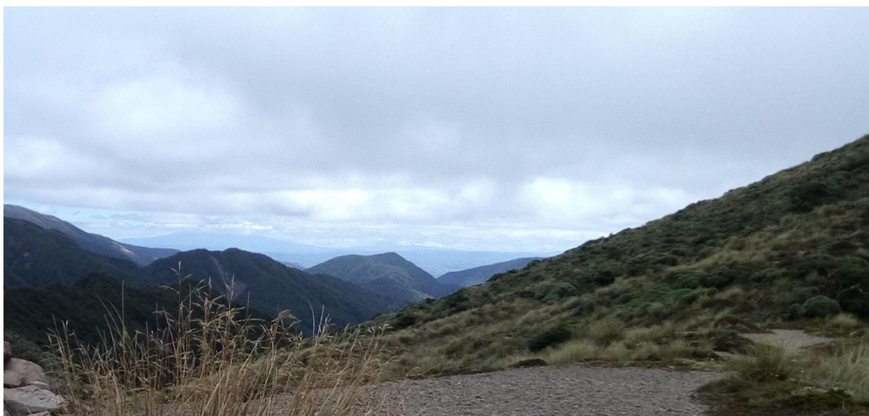
View from Armstrong Saddle north-west to Mt Ruapehu