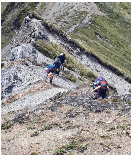
Looking back at the gap where we had to cross the slip.

were a few places where it was a bit tricky. At one point we came to a gap in the ridge with two steep rocks on both sides. It was just before we could see Waterfall Hut. Here we had to carefully scramble down the side of a slip to the west to find the best place to cross it.