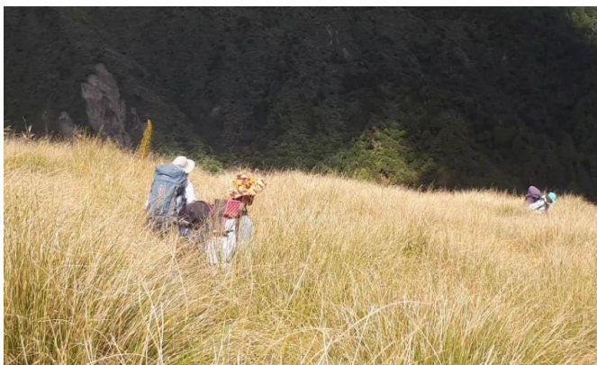
Descent through the holey tussock.

I think most of us fell in one or two holes on the way down. On the tops we mainly heard Skylarks. We gathered at the beginning of the taller trees where there was some shade and had our late afternoon tea.