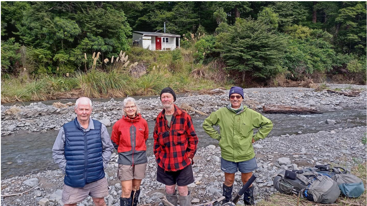
Some of the team at Colenso Hut

On Tuesday we flew out in a larger helicopter. We all enjoyed a well-earned lunch in a nice café in Hunterville.