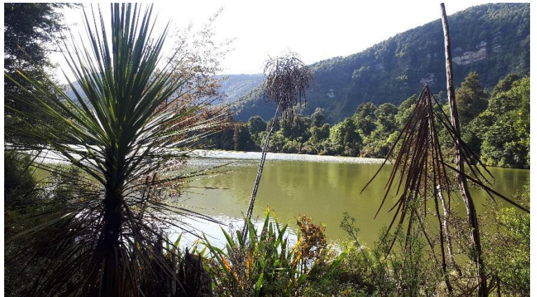
Lake Colenso

When all three teams arrived back at the hut, we all went out to set up a cat trap. We all had a go at setting it so we were prepared for next time (next year maybe!). We had a party in the hut that evening with Ginger beer, popcorn, chips, chocolate and liquorice all sorts.