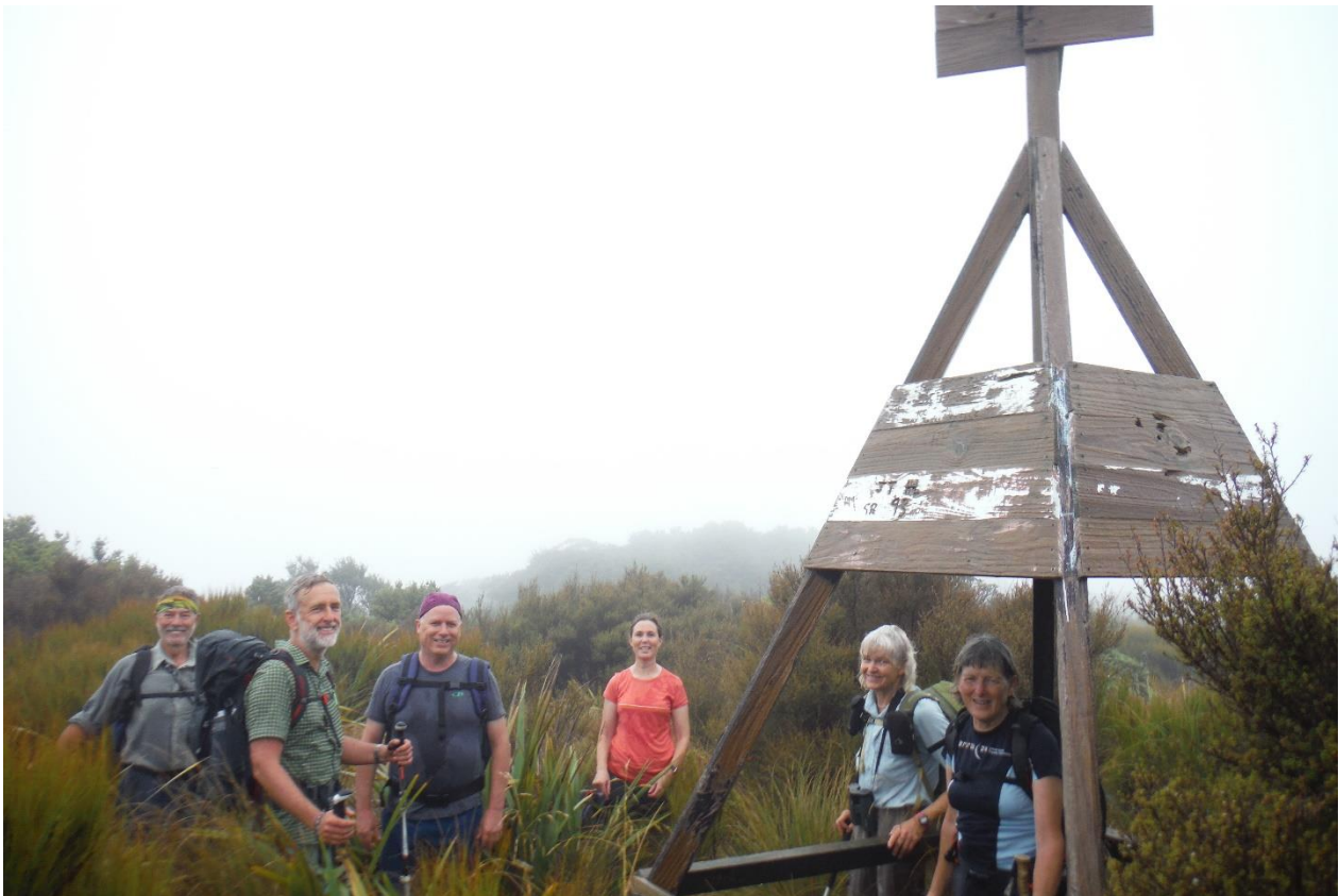
Kaiparoro Trig up in the cloud but no rain, Tararua Forest Park.