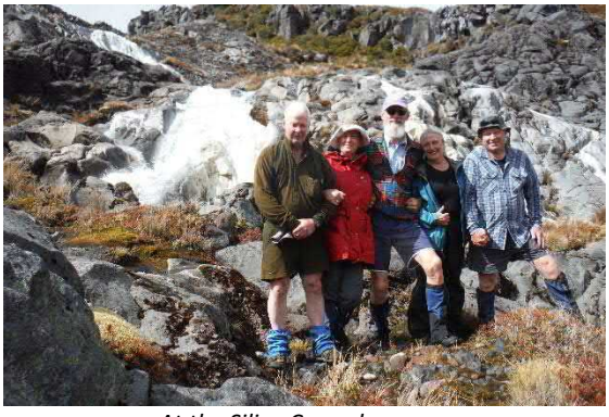
At the Silica Cascade source

The odd cairn lured us across the mountain as we clambered in and out of several rocky gullies. Suddenly some-one spotted what we were looking for. Silica rapids - and very impressive they were.