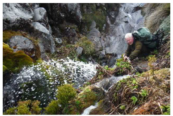
The Secret Fountain

Monday morning was much brighter as we headed off back up the mountain, out the door at a very respectable 7:30 a.m. We dropped off beyond the ski field maintenance buildings and began our quest for the first of our points of interest. The first gully we explored revealed nothing of interest but as we dropped into the second stream bed no more than 20 metres away was what we were looking for. A fountain jet of water gushing out from a split between rocks. We had a close-up look and then continued the search for our second feature.