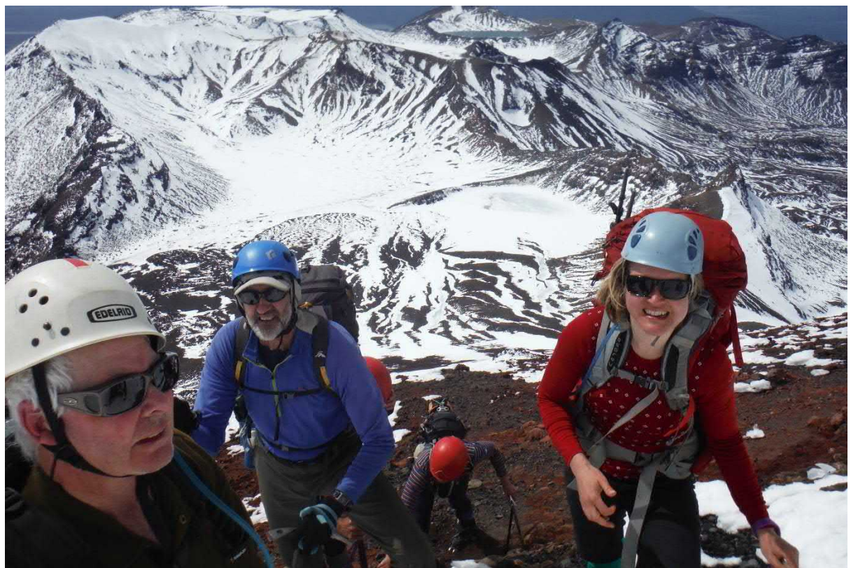
Going up Ngauruhoe on club trip, 4<sup>th</sup> October 2020