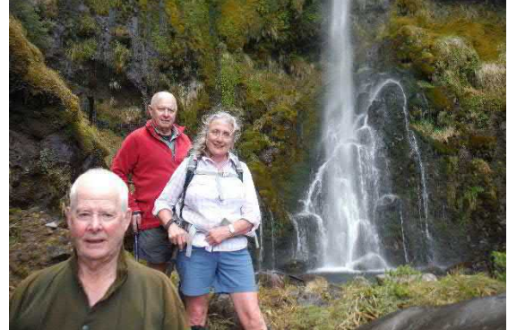
Nice waterfall up sidestream

The early section of this track is part of the Around the Mountain Track and is well maintained. We viewed Waitonga Falls from the main track without venturing along the side-track for a close-up view. From here on the catch cry for the day was to be "let's just wander up here and have a look at the waterfall".