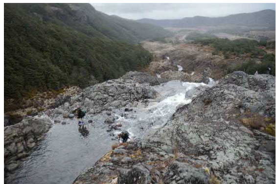
Crossing Silica Cascades

A much better example than what we would see in the afternoon on our way back from Lake Surprise. All that remained to do was for us to find our way down to the rapids. After a bit of trial and error and scouting around we found a path down the mountainside to the rapids where we enjoyed morning tea. We continued downwards hoping to intersect the track to Lake Surprise via Mangaturuturu Hut which is managed by the Wanganui Tramping Club.