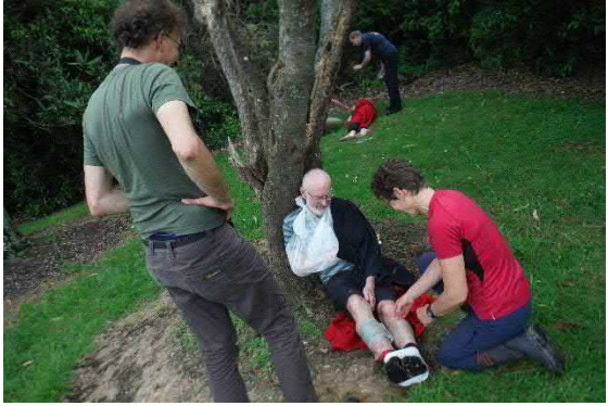
Pic taken on the Outdoor First Aid Course