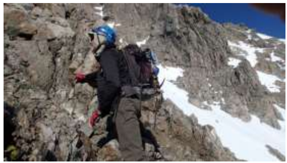
Approach to Rolleston

30 Jan – Mt Rolleston – 2275m - Arthur's Pass National Park