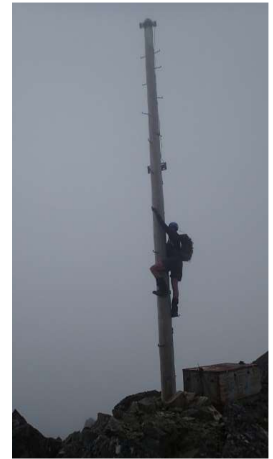
The very top of Technical

We proceeded along the ridge and then into a large bowl at the top of the valley which led to another ridge that went up to the peak. We met a couple that had been most of the way to the peak but turned back because they thought there would be no view from the top. There was a lot of scrambling over rock along the ridge before we had to sidle to avoid the gnarly part. The sidle was over loose rock and scree. As we neared where we thought the peak should be, we still couldn't see where it was. As it is a high point on a ridge, we had to use the GPS to pinpoint where we should go. We climbed up a steep and difficult scree slope and eventually reached some rock to climb up. Once we gained the top we could see the trig and a large pole through the mist.