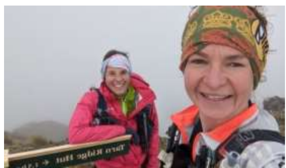
First Photo of the Day at the top of Waiohine Pinnacles

then, right? I'm just really grateful it isn't raining.