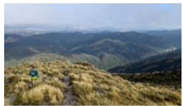
Running down to Powell Hut

Running towards Angle Knob I finally start to feel more human; I am loving this. I have stopped thinking about bailing. We sidle under the Knob and turn towards Jumbo. Run, run, run - this feels amazing! We change direction again and are onto the poled route of the Jumbo-Holdsworth circuit. The waterproof pants and windproof finally come off before the climb onto Mt Holdsworth and we begin the steady descent to Powell Hut, eyeing the Waiohine valley spread out far below us.