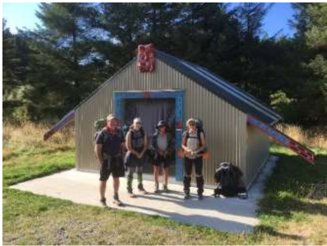
Motorimu Whare on the Burtton's Track to Gladstone Rd section of the Te Araroa trail.