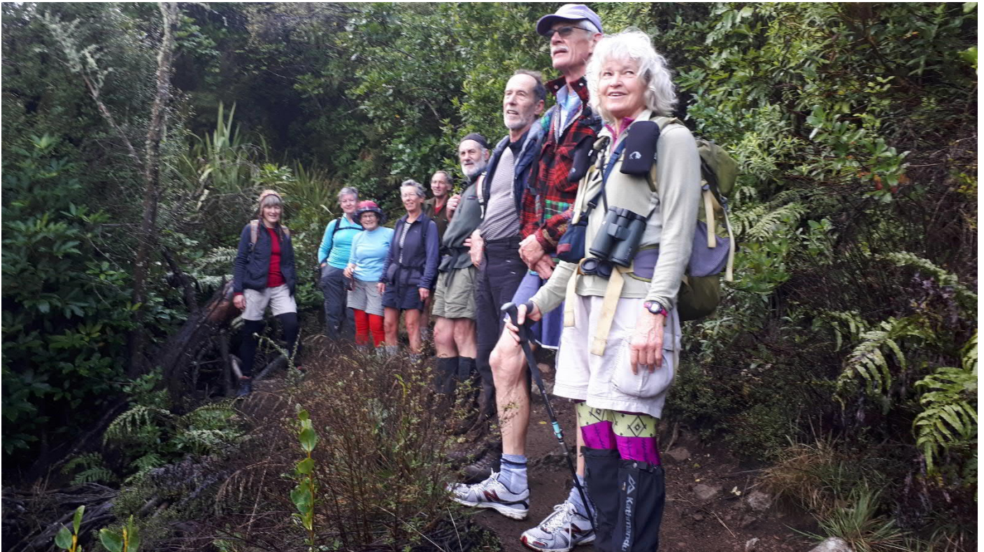
The Mt Tauhara expedition party enroute.