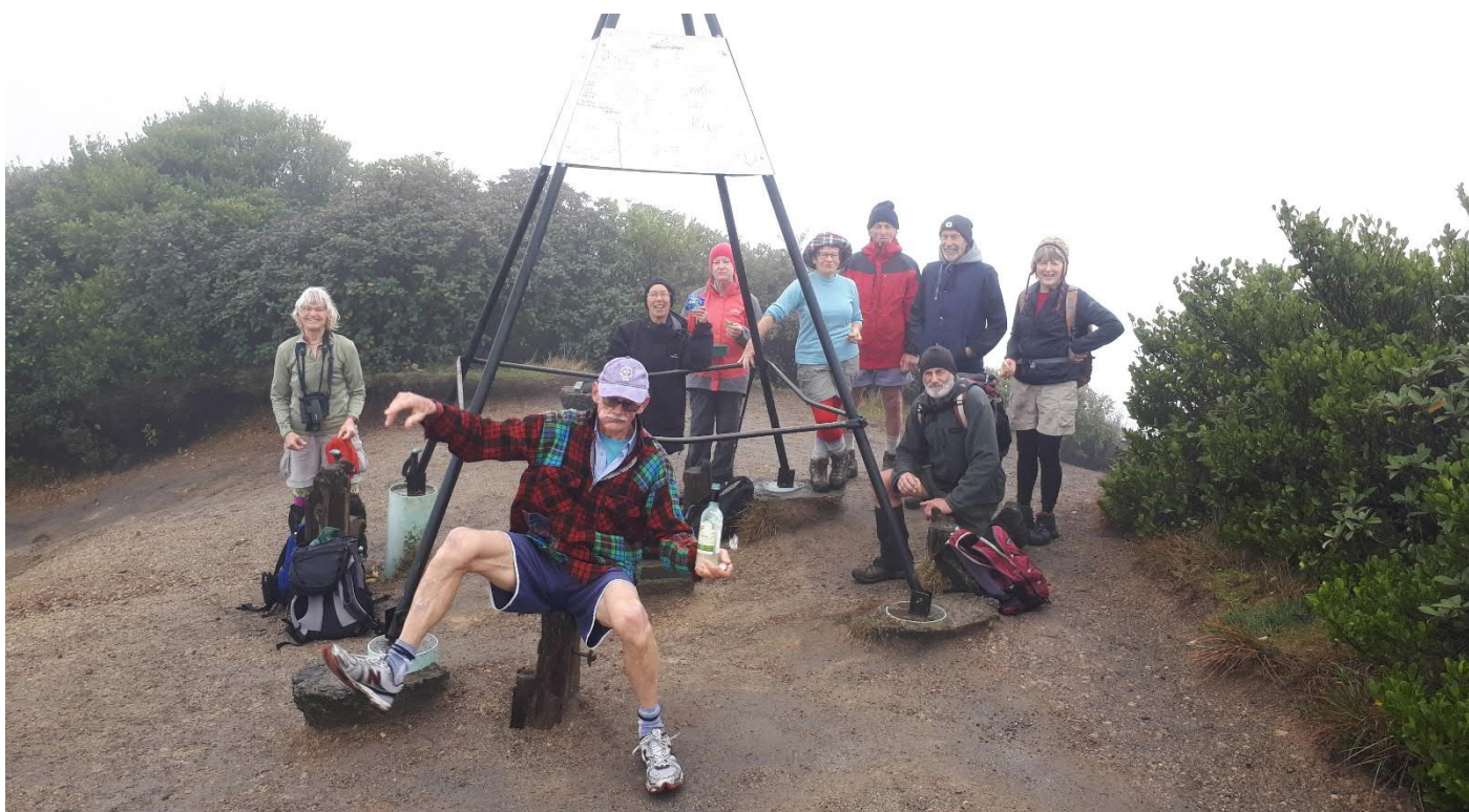
On top of Mt Tauhoro during our mid-winter gathering at Taupo. See trip report