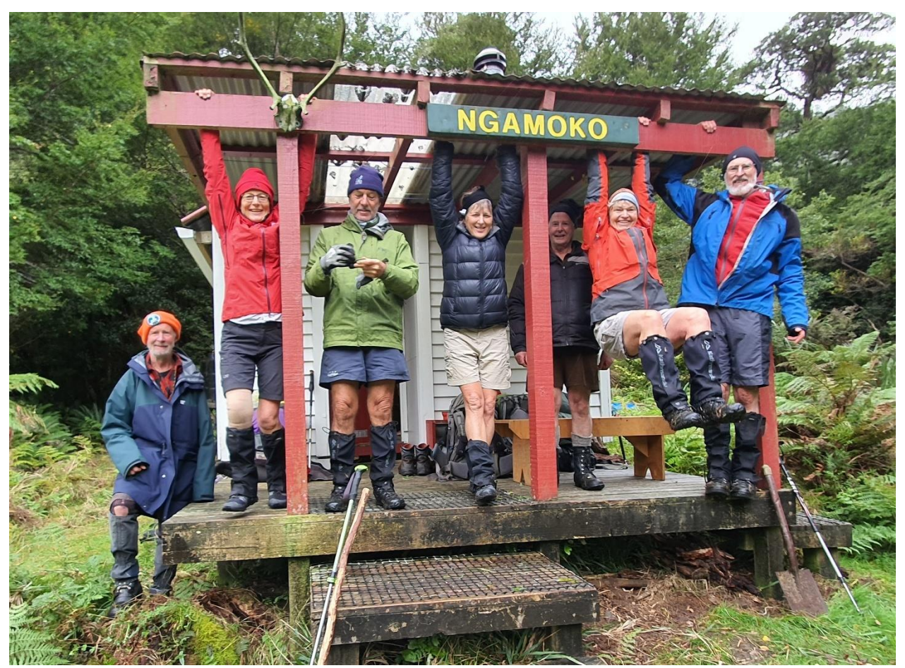
Hut maintenance team enjoying a break at Ngamoko Hut.